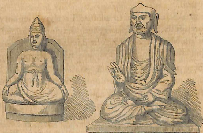
Images of the Cochin Chinese Buddha.

“The population of the hills appeared to be extremely scanty. We saw but two villages. The inhabitants spoke the Burman language, but were dressed in the costume of the Shans. There is, however, a wild race on the mountains, known to the Burmans under the name Danno, but we saw none of them.”