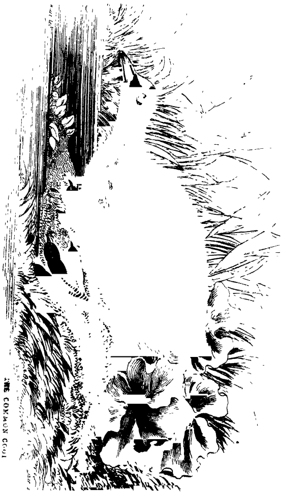
THE COMMON COW