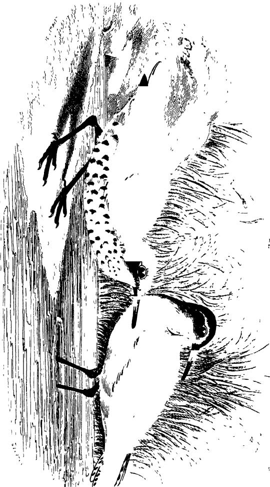
SPOTTED TOTANI S