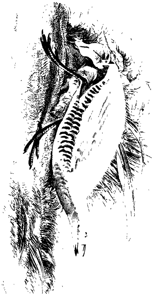
MEADOW OR GREEN CRANE