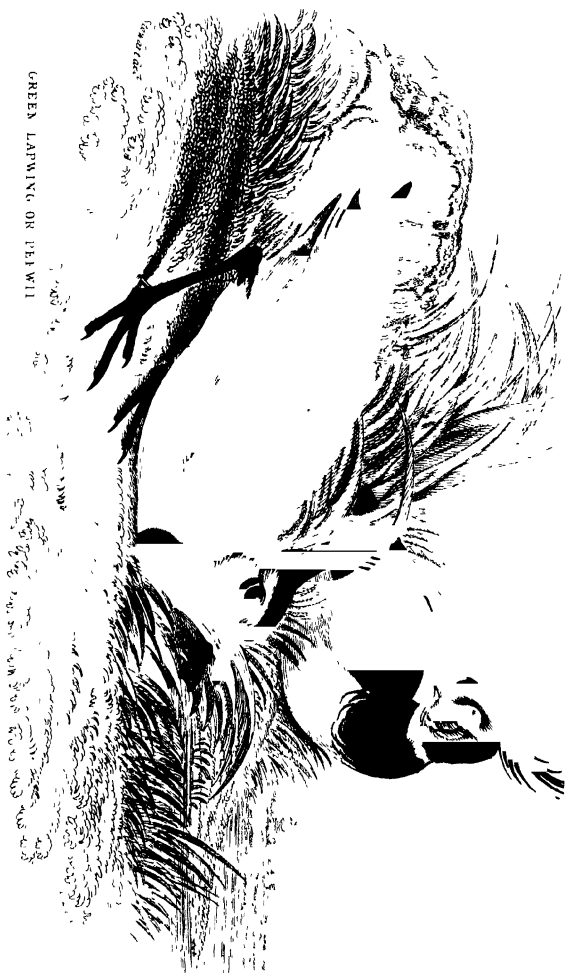
GREEN LAPPING, OR PETWILL