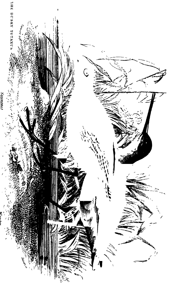
THE DUSKY TOTANTI