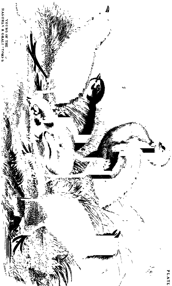
YOUNG OF THE " " RASBILLS & GRALLI TORUS