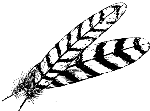
S. gallinago and major

with white, broadly margined with pale ochreous-yellow, and undulated on their middle surface with lines of chestnut-red, the pale edges forming four lines along the back ; the wings are greyish-black ; secondaries tipped with white, the coverts broadly tipped with white and tinted with ochreous ; the long tertials are edged with pale greyish-white, and undulated on their outer webs with pale chestnut-brown ; the tail consists of twelve lanceolate feathers, and exhibits a form more wedge-shaped than most of the others, the colour is blackish-brown, edged with pale chestnut-brown ; the belly and under parts pure white, on the flanks dashed with greyish-black, and tinted with brown ; the axillary feathers white, clouded irregularly with blackish-grey ; feet and legs greenish-grey.