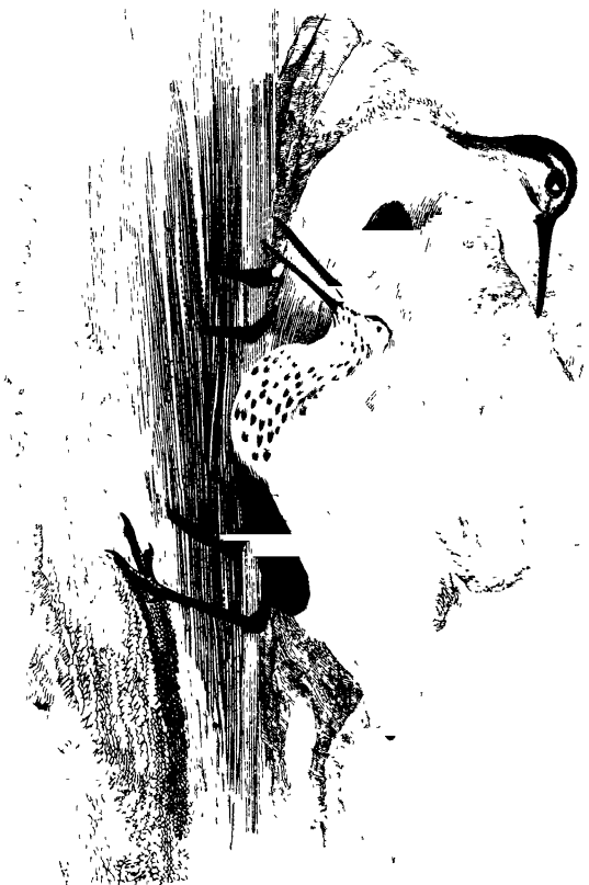
PURRE OR DUXLIN