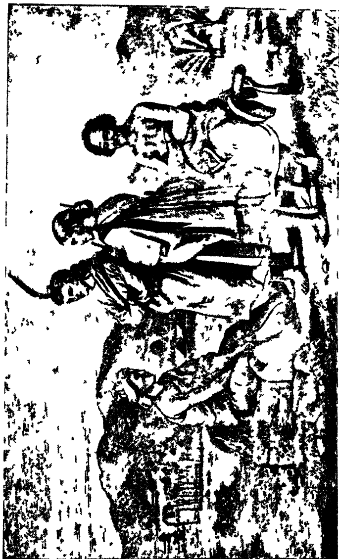
A GROUP LUSHAI—POI—LUSHAI—SOKTE