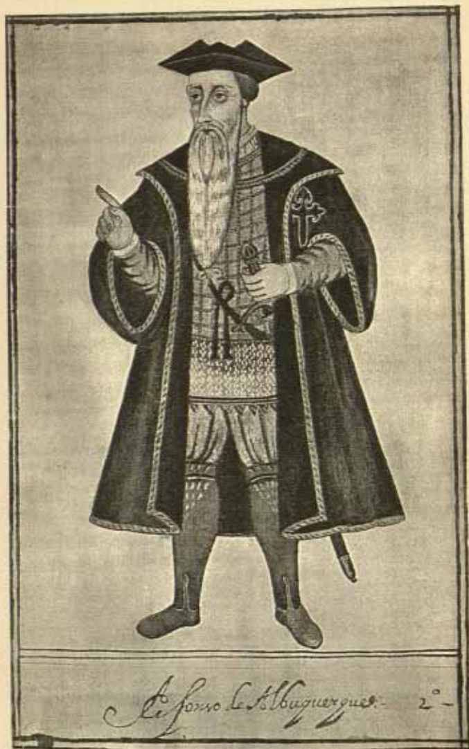
Le fonsso Le. Albuquerque. 2 o -