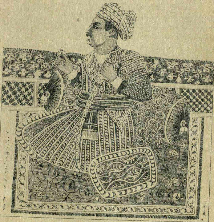
MIRZA NUJUFF KHAN ZULFICAR AL DOWLAH.