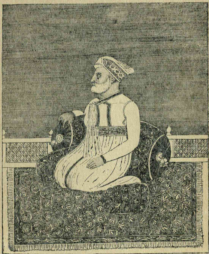
MAJD UD DOWLAH.