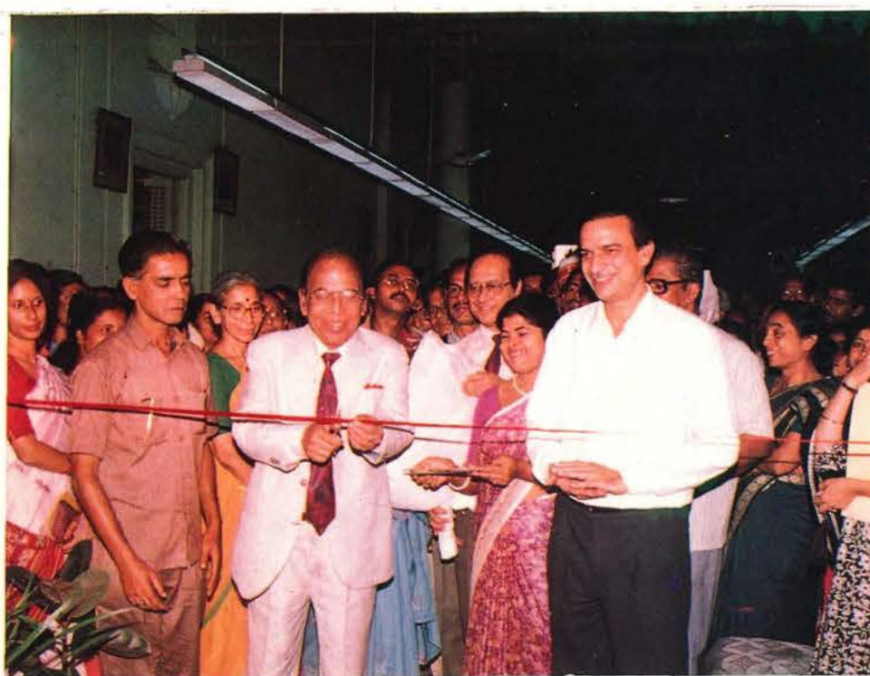
Dr. Anutosh Dutta, the Sheriff of Calcutta, inaugurating the First Exhibition on Little Magazines in Indian languages.

The National Library, Calcutta in collaboration with All India Little Magazine Fair Committee, 1993 organised an exhibition on "Little Magazines in Indian Languages" in the Main Building of the Library. The exhibition was inaugurated by Dr. Anutosh Dutta, the Honourable Sheriff of Calcutta on 24.11.93 at 3.30 P.M.