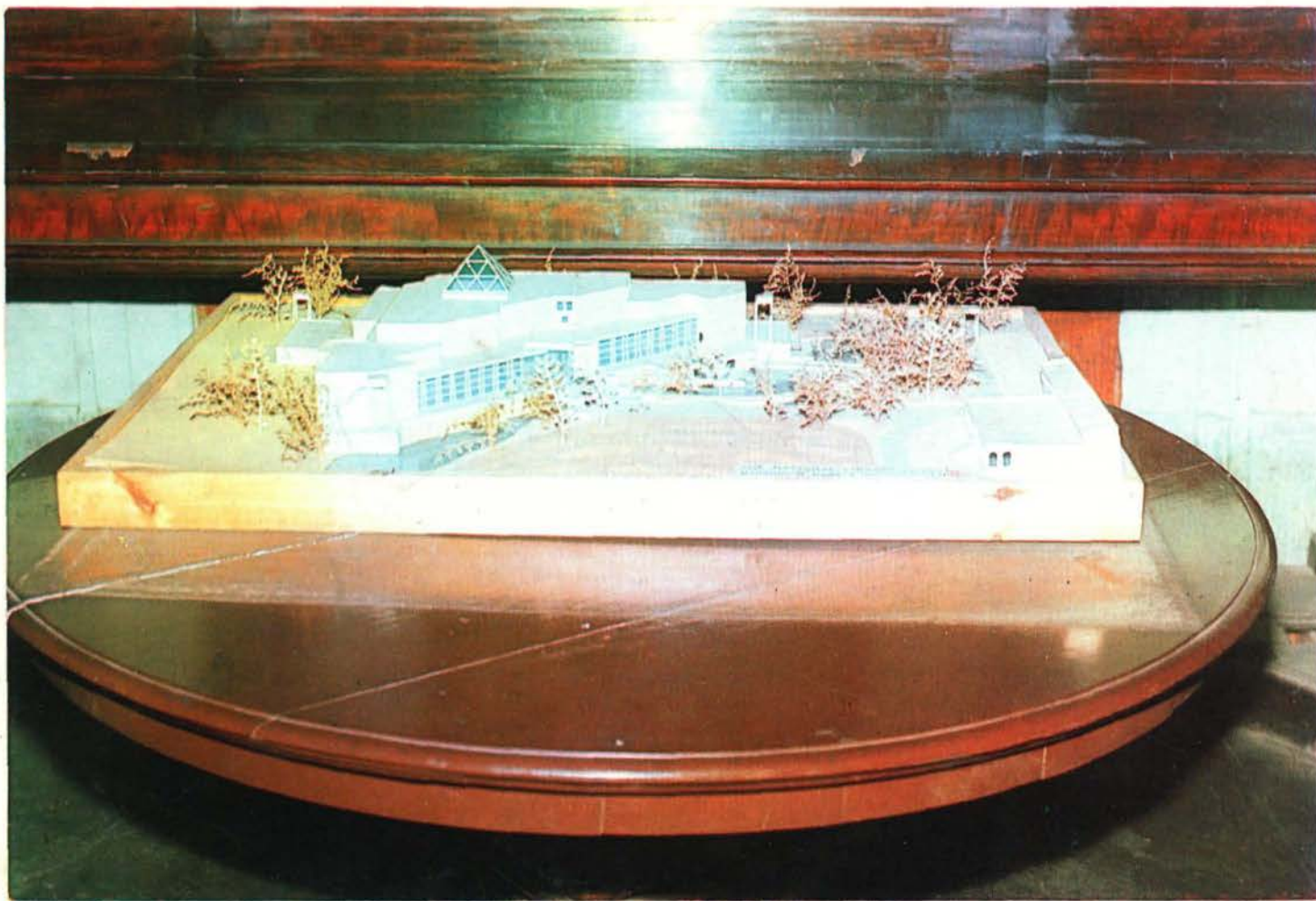
Model of the Central Annexe "Bhasha Bhavan" which is under construction in the National Library Compound.