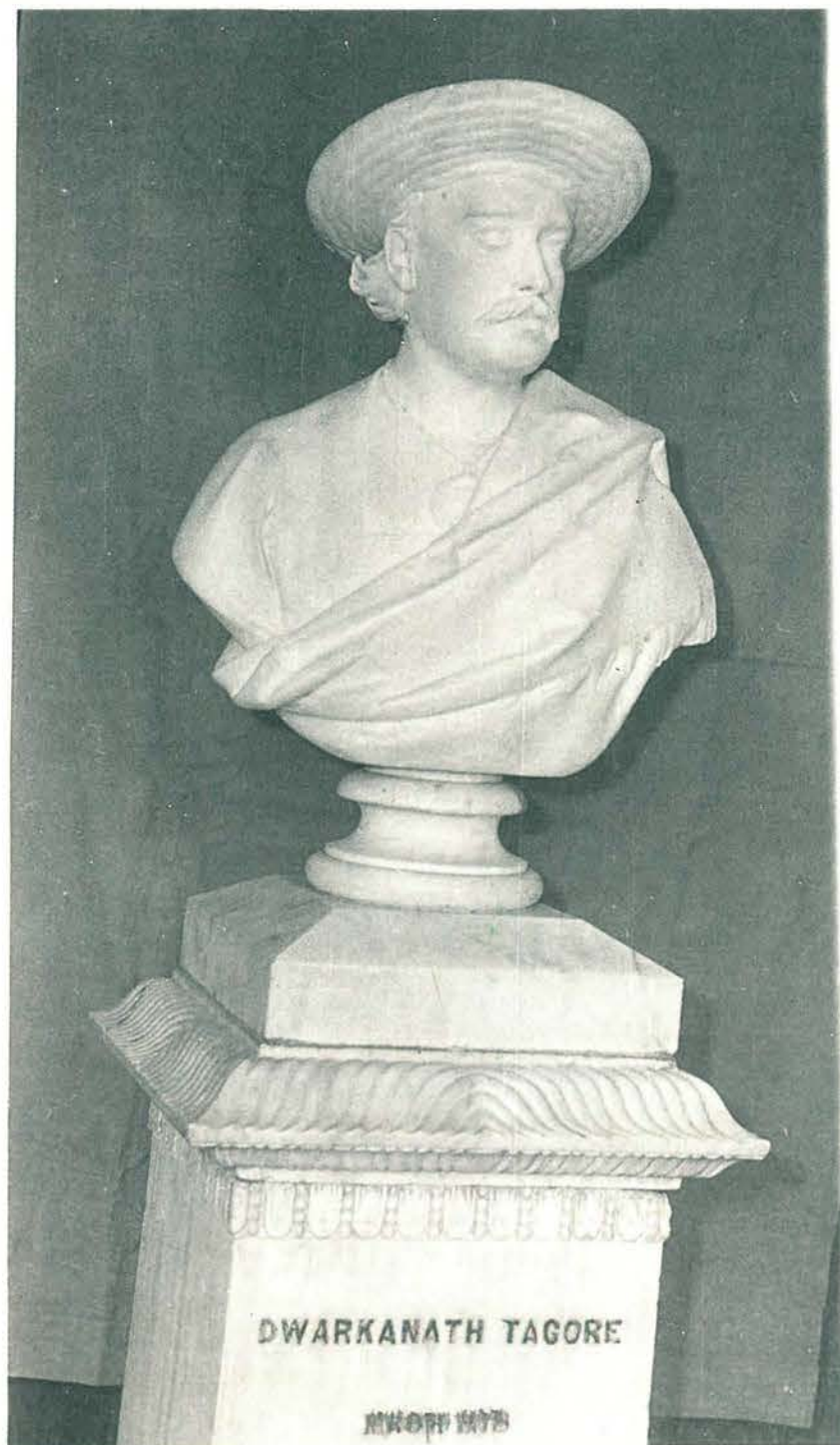
The bust sculpture of Prince Dwarkanath Tagore, grand father of Nobel Poet Laureate Rabindranath Tagore at the entrance of the Main Building of the National Library.