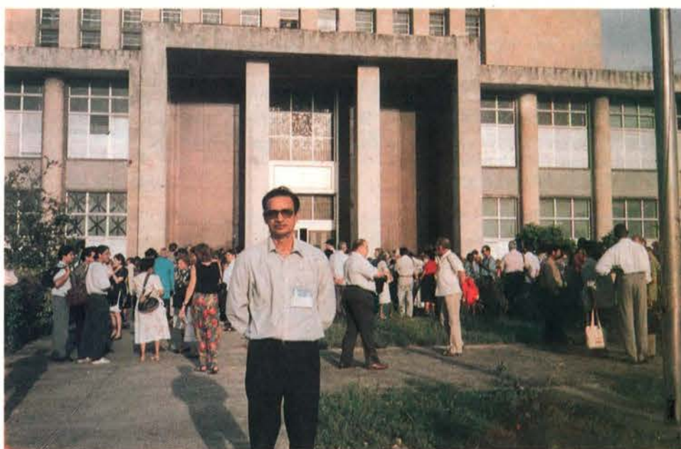
The Director in front of the National Library of Cuba, Havana along with other Directors of National Libraries.

In Conference of Directors of National Libraries where among others, resolution on resource sharing through modern technique such as Networking was adopted. The present poor condition of Russian National Library and the destruction of ex-Yugoslavian National Library was also received special attention for restoration and maintenance.