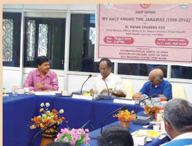
Narrative on perceptive Medical Science