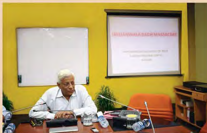
Jalianwala Bagh massacre and the society there after- a discussion

On 12 April 2019, the An.S.I. held a meeting in the Seminar Room of the Eastern Regional Centre (E.R.C.), Kolkata, on the Jalianwala Bagh massacre. The speakers were from the Survey, both from the Headquarter and the E.R.C. Two issues were taken up in the discussion-meeting. The first concerned the lessons we learn from the Jalianwala episode of 13 April 1919, the day