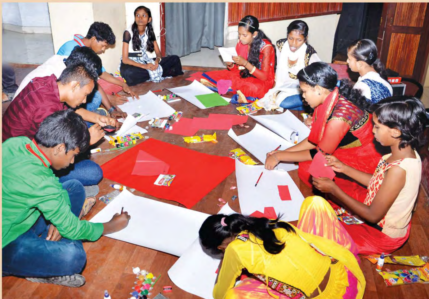
Civilization and Museum- through the Children's eye