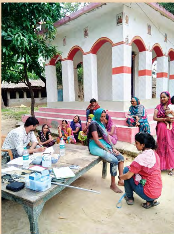
In the health awareness camp

A team of anthropologists from the North-Western Regional Centre, Dehradun organized a week long health-awareness camp for screening genetic disorders among the Jaunsari of Uttarakhand.