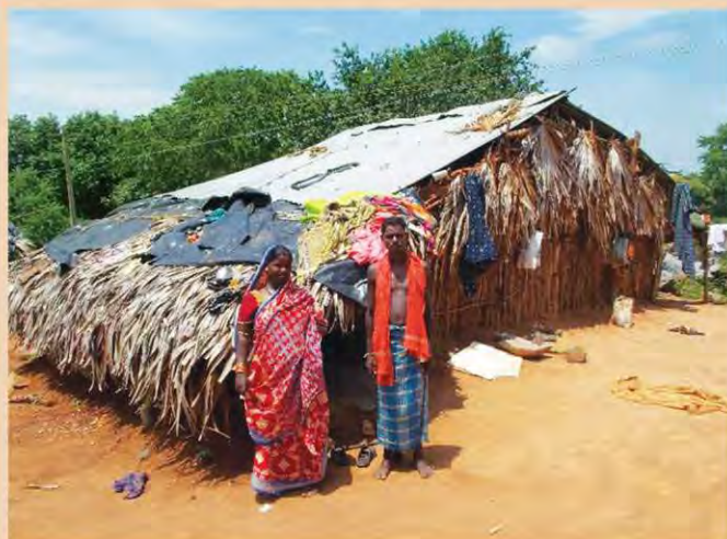
Habitat and hut- Yanadi of Ganjam, Odisha

The Yanadi community is still stigmatized with criminal background. Both local people and local police administration believe that they are continuing with the practice of criminal activities in the form of burglary, snatching, etc. Therefore, the Yanadi community is under surveillance of police administration.