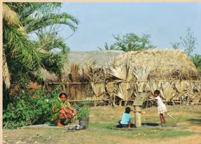
"A life less ordinary"- Dhekaru of West Bengal

block, and they crushed iron ores and smelted it to make sponge iron locally, which was used to make various weapons and agricultural implements. East-India Company, Kolkata, also engaged this community as master iron smelters and employed them as labourers in their company (McKay) at Mohammad bazar, Raniswar block, Birbhum, until 1856. However, after the closer of the McKay Company's unit at Birbhum, nearly 1500