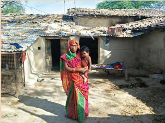
The Mother and Child - Khatik of Uttar Pradesh

patrilineal and patriarchal. Village exogamy and caste endogamy is observed. Monogamy is the norm, but polygamy is permitted in some cases. Marriages are settled by negotiation and dowry is in vogue, given in cash or kind. Inter-caste marriages are happening sporadic among educated persons.