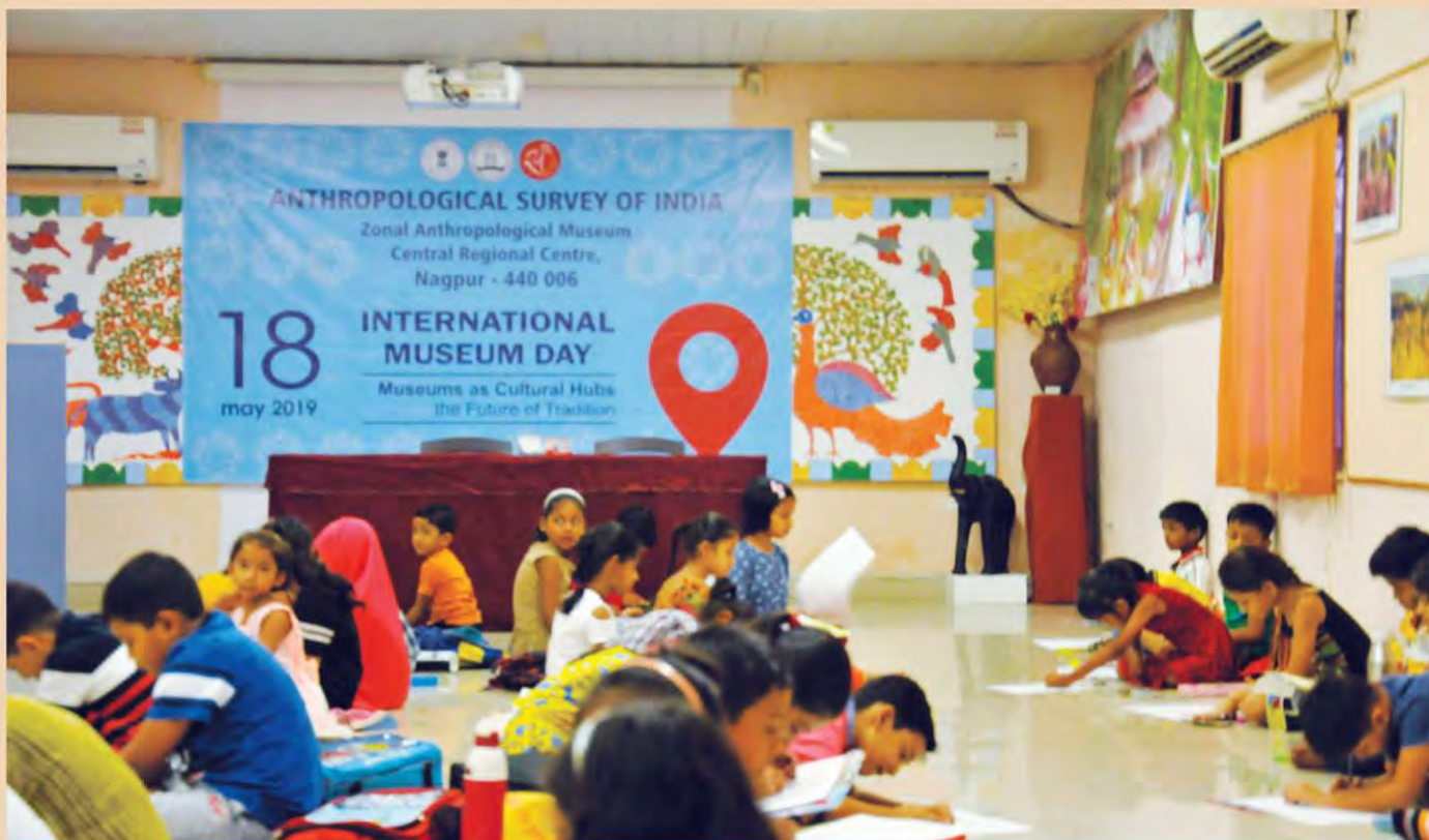
Celebration International Museum Day at the Central Regional Centre, Nagpur

the content of the displays in Zonal Anthropological Museum of Central Regional Centre. The quiz program was quite interactive and the parents and teachers took great interest in responding to the questions. The quiz was organized with an aim to raise awareness about the museum and the objective behind an Anthropological Museum.