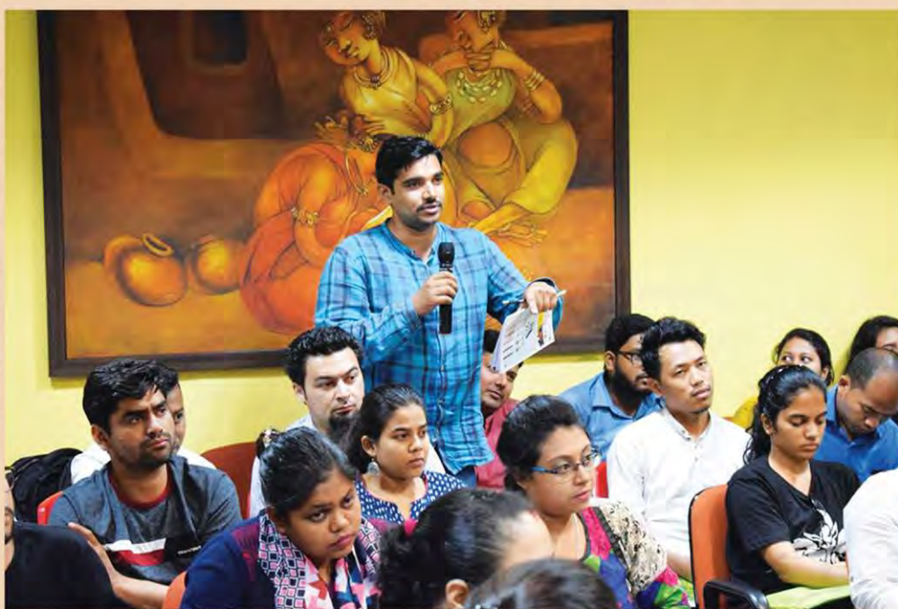
Our descendants - orientation course under Research Fellowship Programme

All aspects of the anthropological research were covered in the workshop. Museum studies, human growth and development, remote sensing, cultural ecology, culinary art, and molecular genetics, were some of the topics on which lectures were delivered. This year, in the national project that deals with a study of denotified communities, along with nomadic and semi-nomadic, we have introduced a survey of the consumer