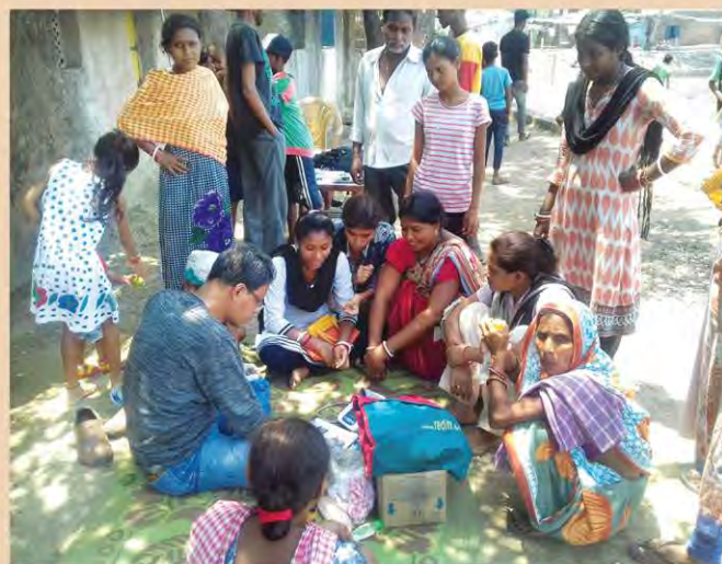
From laboratory to mass - anthropologist among the community members

In accordance with the on-going research project, "Anthropological Study of Nomadic, Semi-Nomadic and De-notified Communities", the Physical Anthropology division of the Survey has been carrying out fieldwork among the Bhar (Uttar Pradesh), Bansphor (Meghalaya), Ghasi (Odisha) to ascertain nutritional status along with general health and hygiene status of the community under broad objectives of "General Health Hygiene and Nutritional Anthropometric Study among the De-notified Nomadic, Semi-nomadic Communities."