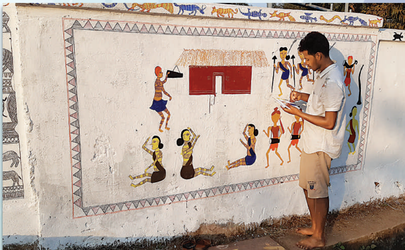
Muria Mural painting

popularity across the globe, in beautification of cities with aesthetic senses. It fulfills dual purposes, beautification as well as keep spaces free from public nuisances. In view of the both, the Sub-Regional Centre of the Anthropological Survey of India, Jagdalpur, decided to decorate premise wall of the office with rich art tradition of Murias of Chhattisgarh. Accordingly, three Muria tribal artists from Narayanpur district were invited, who with steady hands created murals, depicting the own world of Muria thematically.