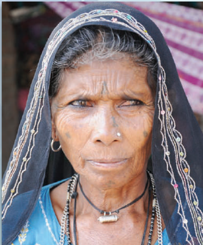
The Kalbeliya lady

group till last few years was largely involved in snake charming and lived on catching snakes and selling venom to the buyers including working as daily wager in agricultural or construction works. But now after the implementation of Wild Life Act 1972 and reservation of forests snake charming as a livelihood process has become difficult for them and they are unable to carry out the traditional livelihood in open. As a result, most of them deny their involvement in snake charming but love to speak of the old glorious times of snake charming. The restriction of snake charming has now forced the old generations and weak to beg in the markets and town and many able-bodied have opted for daily wages and petty business of selling the blankets, clothes and plastic items seasonally. A small group among them is now making the business of making decorative sticks know as lath from bamboo sticks and selling those in the markets near the temples of Ujjain. This business has created opportunities to subsidiary business also.