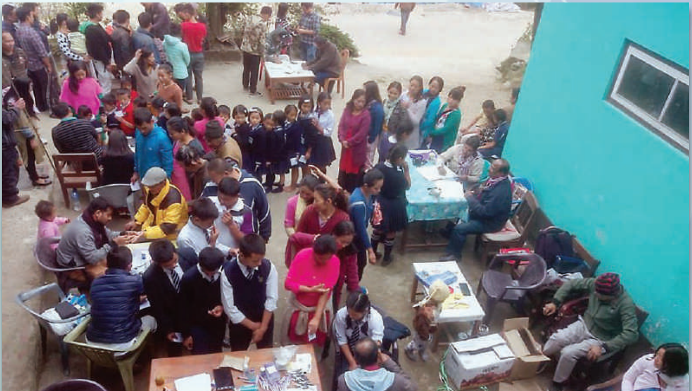
Health Awareness Programme, Sikkim

inherits her mother's gods, and when she marries and lives with her husband, she brings with her deities that will then be recognized as the household deities. Limbu bury their dead and observe death rituals for two to three days. Nikwasamma is a death ritual done to cleanse the house by Phedangma . Relatives, neighbours, and visitors offer money as a mark of respect and put the same on the top of the dead body. The traditional dress of the Limbus is Mekhil and Taga . Akin to many indigenous people they are shamanistic and worship nature. The Limbus traditionally practice subsistence farming. The Limbu women weave Dhaka fabric cloth on their traditional small handlooms made from bamboo and wood. They are non-vegetarian.