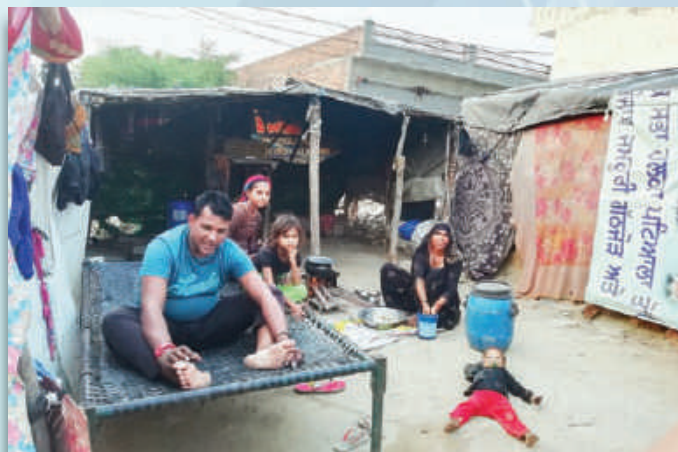
Life goes on- A happy Sansi family