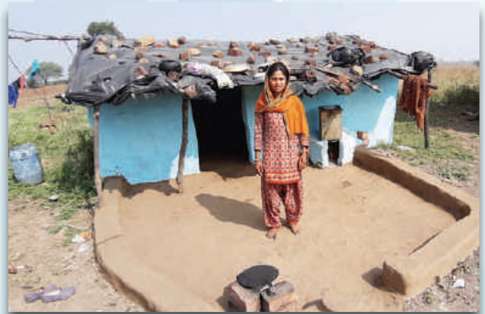
Bijoria lady and her abode

of the army of Chittorgarh kingdom. According to a legend, their community has descended from a woman called 'Bijori Kanjri; a Kanjar girl'. In local parlance, the word Kanjar denotes the placenta. The legend says that Bijori Kanjri is a female dancer and incarnation of Devi Shakti deputed by Bramhaji for the testing of twenty-four Bagdawat brothers (the ancestors of Gujar community).