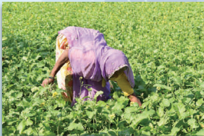
Kitchen garden is an essential part of the Moghiya life

The community recalled that some hundred years ago they were involved in thieving and robbery and had a semi-nomadic life. But after settling in the villages they have left these criminal activities and are now earning the livelihood through the wage labour and agriculture.