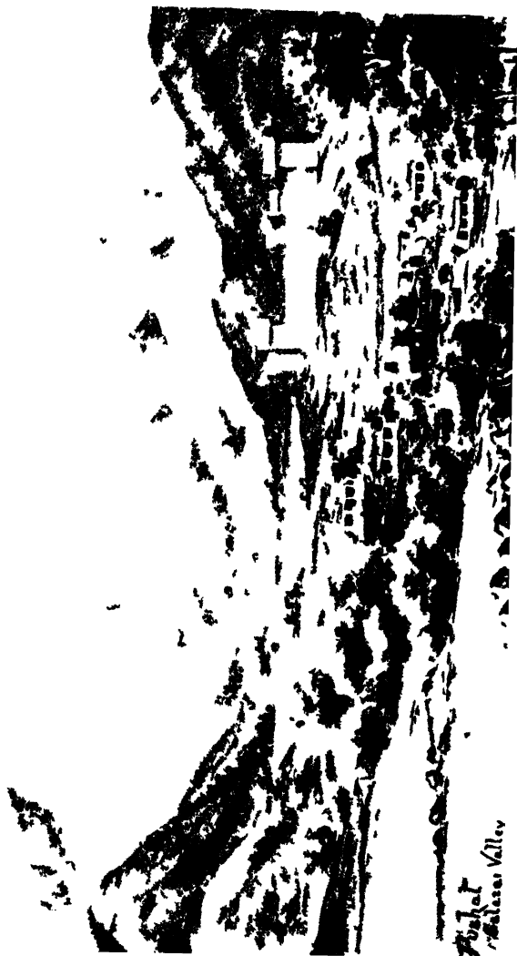
Highat Salinas Valley