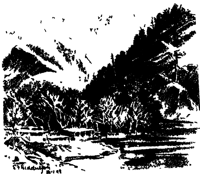
III FARA ZIARA