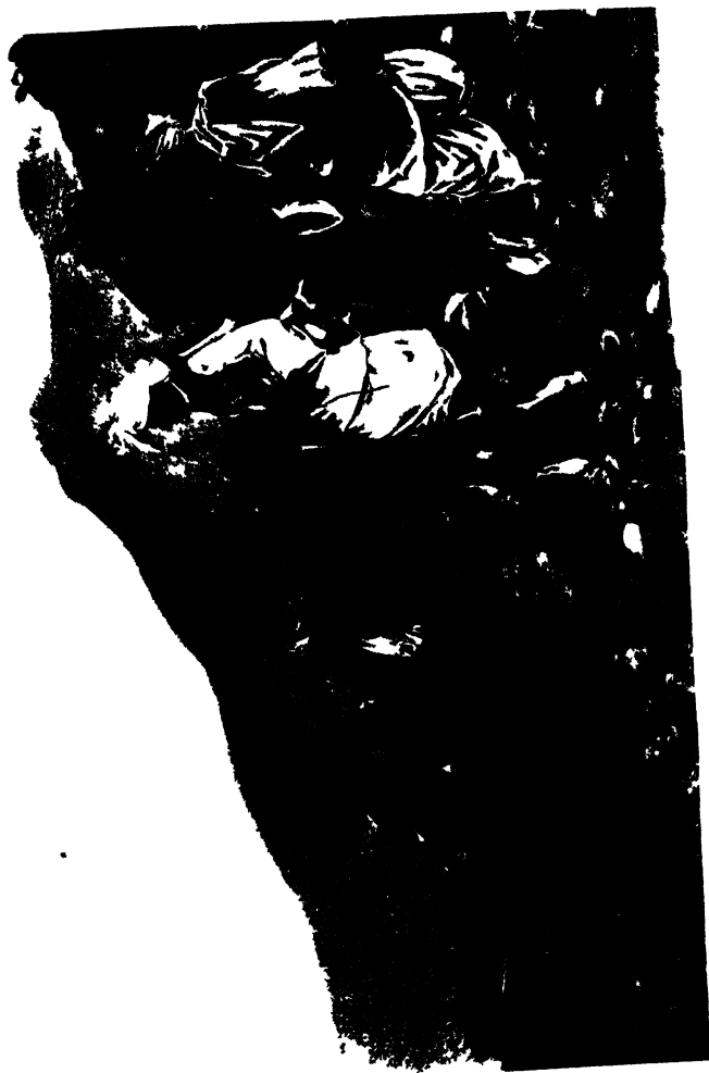
THE A N D V LLA