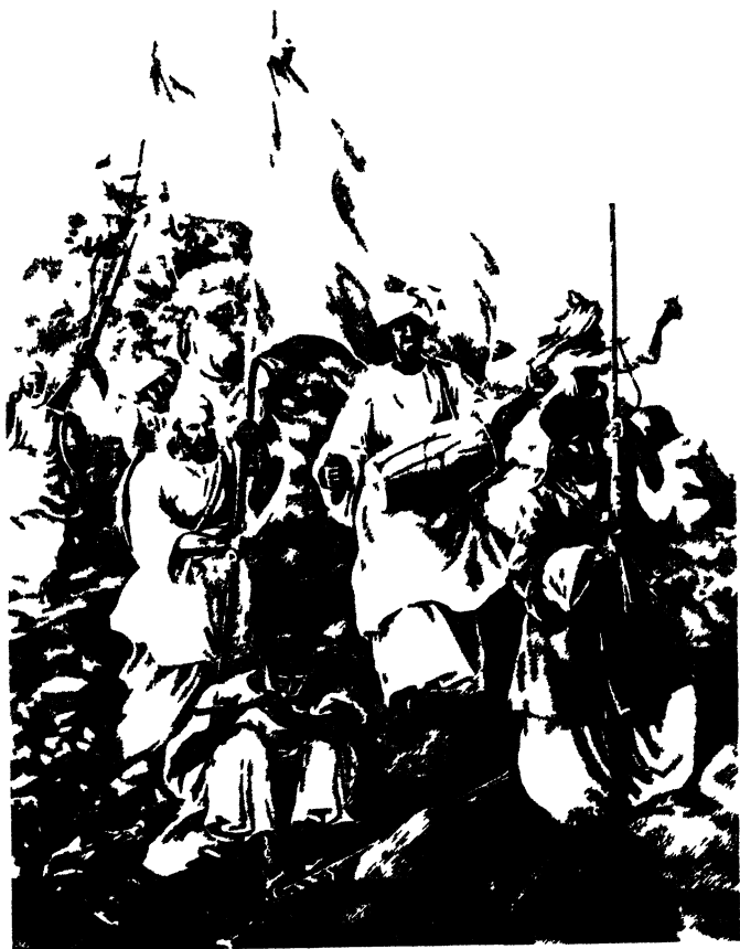
TO ENCOURAGE THEIR FRIENDS