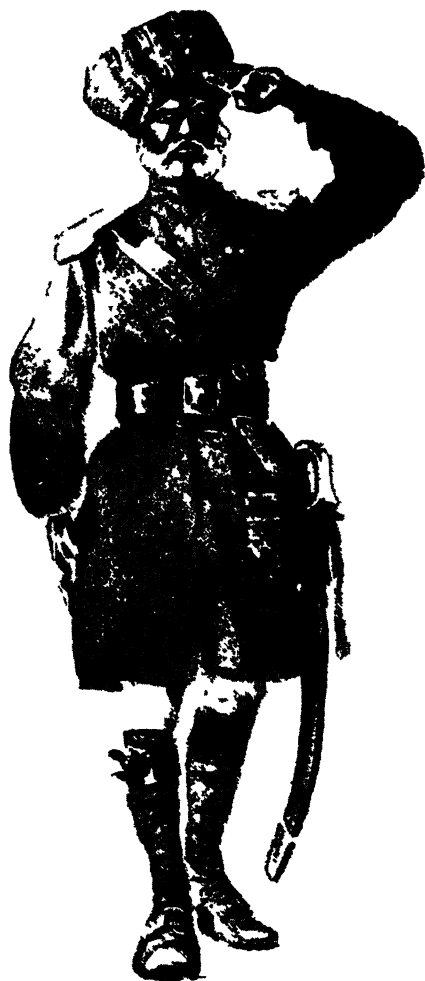
A SIKH ORDERLY