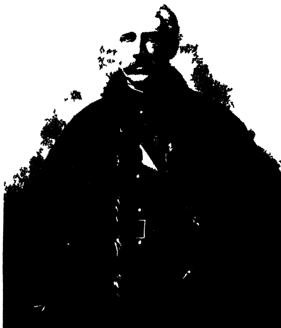
MAJOR GENERAL SIR BINDON BLOOD K.C.B.