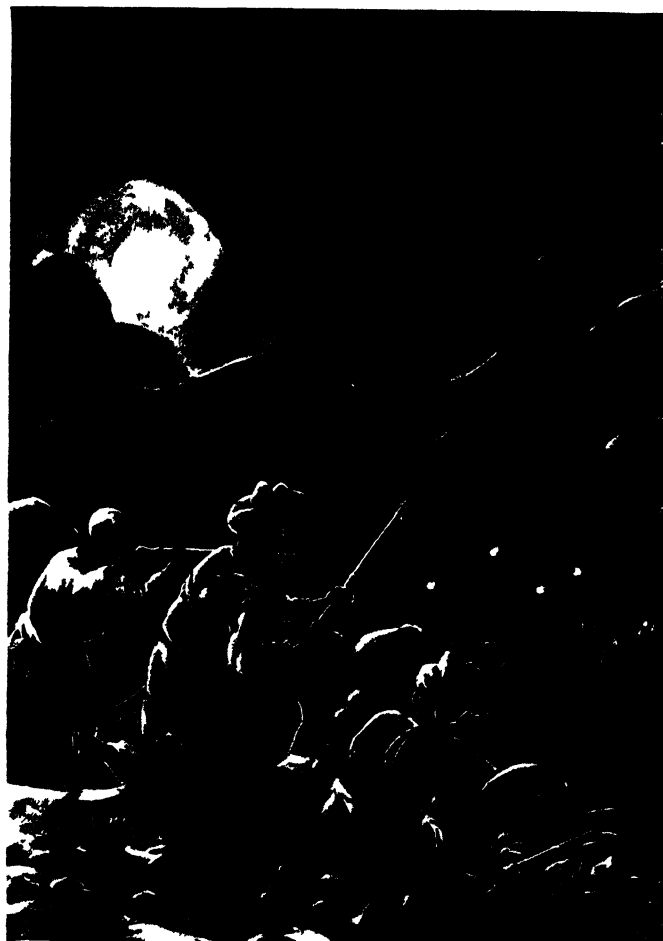
53111 J THE CAMP AT LIGHT