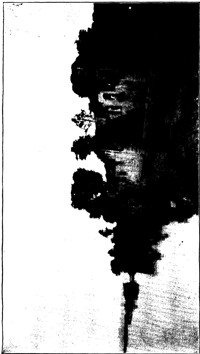
FATEH WADI, OR THE GARDEN OF VICTORY, NEAR SARKHEJ ON THE SABARMATI, AHMADABAD