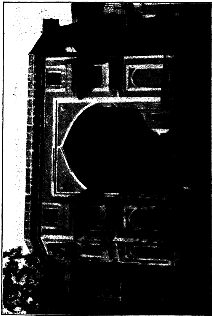
FAÇADE OF AZAM KHAN'S SERAI AT AHMADABAD Built 1637