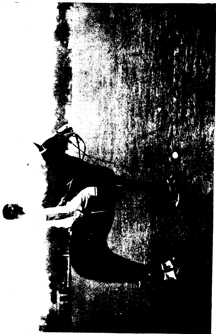
FRANCIS AT POLO.