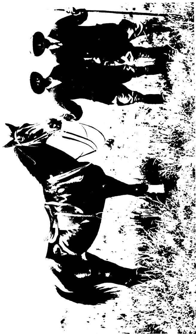
THE TWINS AFTER THE KADIR CUP.