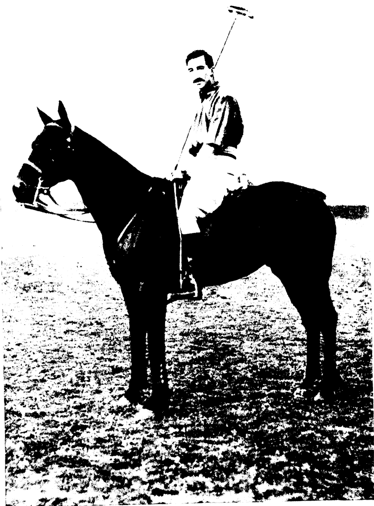
RIVY ON "CINDERELLA."