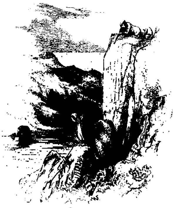
Loch near Rhicennich.