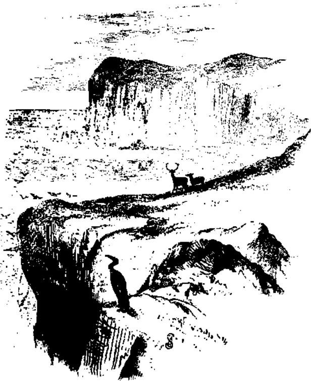
View of Uliten Head