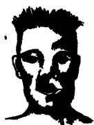
A Laos of Muang Haut