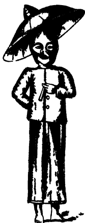
A young to face p 46