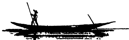
A Dingy or "dug out" on the Me Ping River