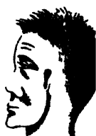
A fellow Traveller