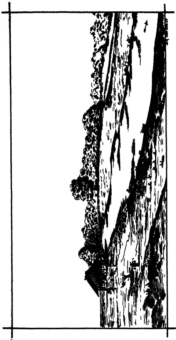
LOOKING UP THE ME PING RIVER FROM MAUNG HAUT