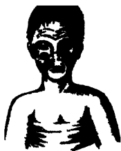
An old lady who loved opposite me at Kiang Tung