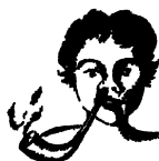
aged 3 years to face p 60