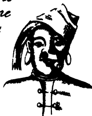
A Kakow hill woman