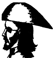
My own sweet self after leaving Zimmé