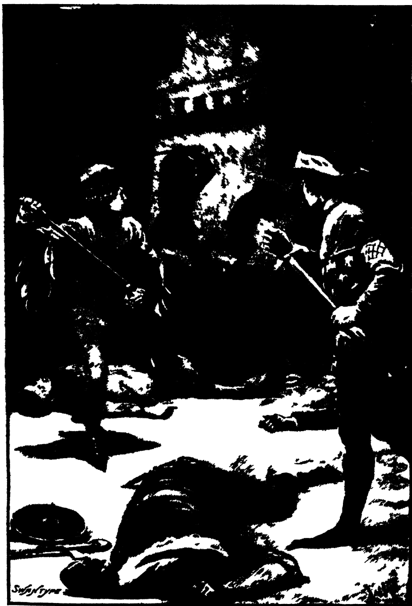
GUY AND LONG TOM COME TO THE RESCUE OF COUNT CHARLES.