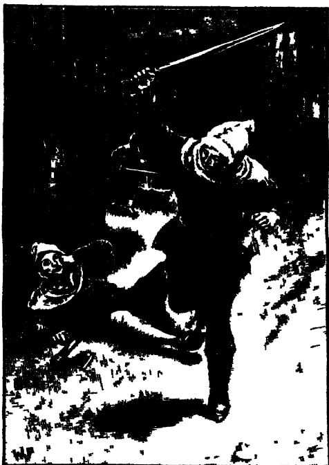
Reduced Illustration from "At Agincourt"

"The mission of Ned to deliver letters from William the Silent to his adherents at Brussels, the fight of the Good Venture with the Spanish man-of-war, the battle on the ice at Amsterdam, the siege of Haarlem, are all told with a vividness and skill which are worthy of Mr. Henty at his best"— Academy