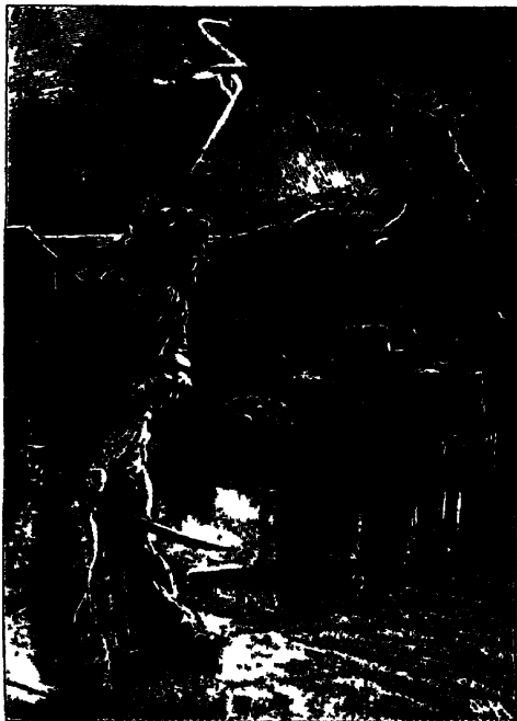
Reduced Illustration from "The Log of a Privateersman"

"One of the most attractive gift-books of the season"— The Academy