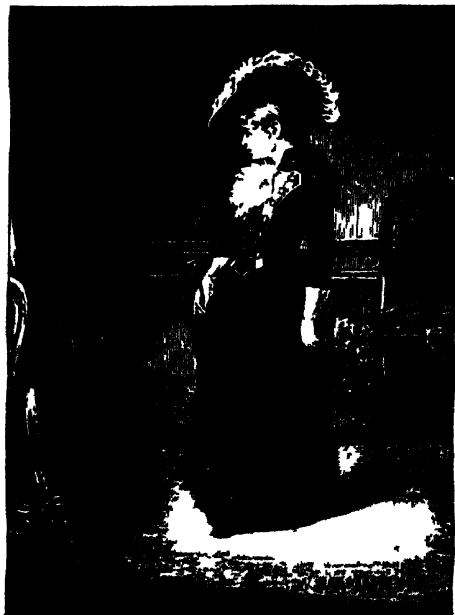
Reduced Illustration from "Cousin Geoffrey"