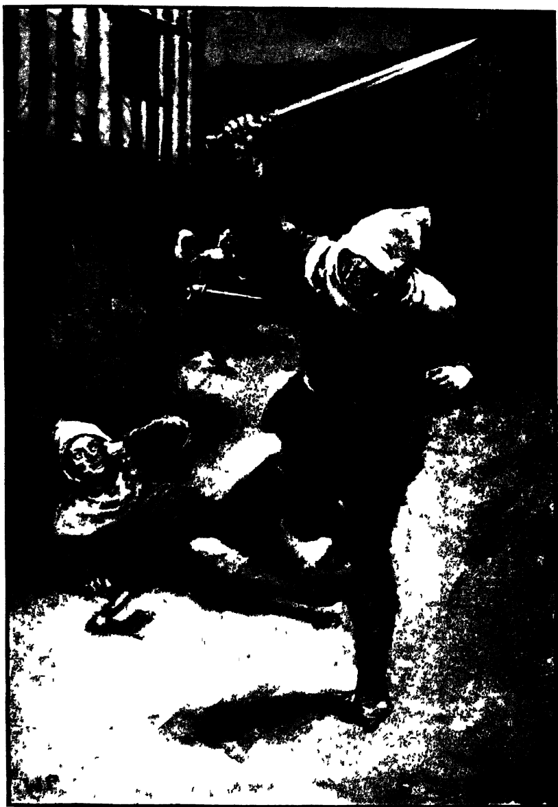
"GUY DELIVERED A SLASHING BLOW ON THE BUTCHER'S CHEEK, AND DASHED PAST HIM.