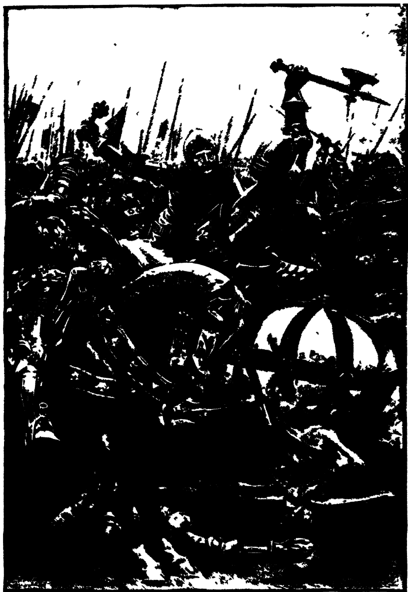
GUY AYLMER SAVES THE KING'S LIFE AT THE BATTLE OF AGINCOURT.