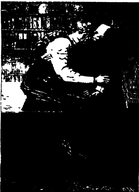
Reduced Illustration from "A Girl in Spring-time"

"Will please by its simplicity, its tenderness, and its healthy interesting motive It is admirably written"— Scotsman