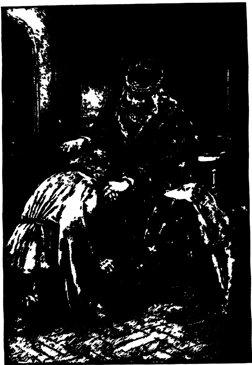
"THE KING EXTENDED HIS HAND TO GUY, WHO WENT ON ONE KNEE TO KISS IT "