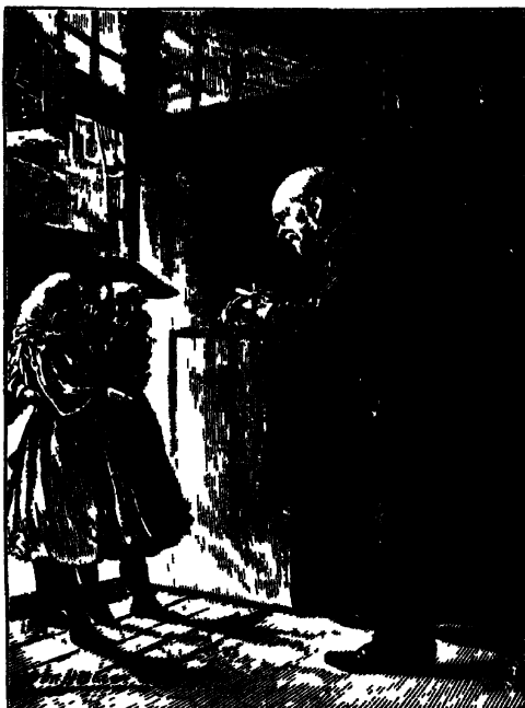
From " Things will Take a Turn " (Reduced)

"We wish the winds would tell us stories like these. It would be worth while to climb Primrose Hill, or even to the giddy heights of Hampstead Heath in a bitter east wind, if we could only be sure of hearing such a sweet, sad, tender, and stirring story as that of Hilda Brave Heart, or even one that was half so good."— Academy