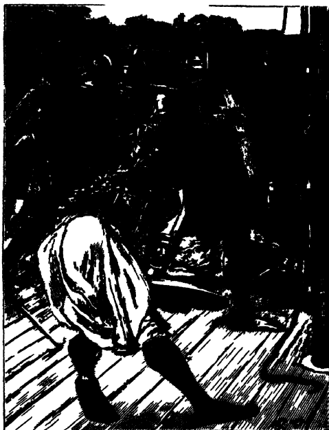
Reduced Illustration from 'A Knight of the White Cross'

Eve A Tale of the Huguenot Wars. By G A HENTY Illustrated by H J DRAPER 6s