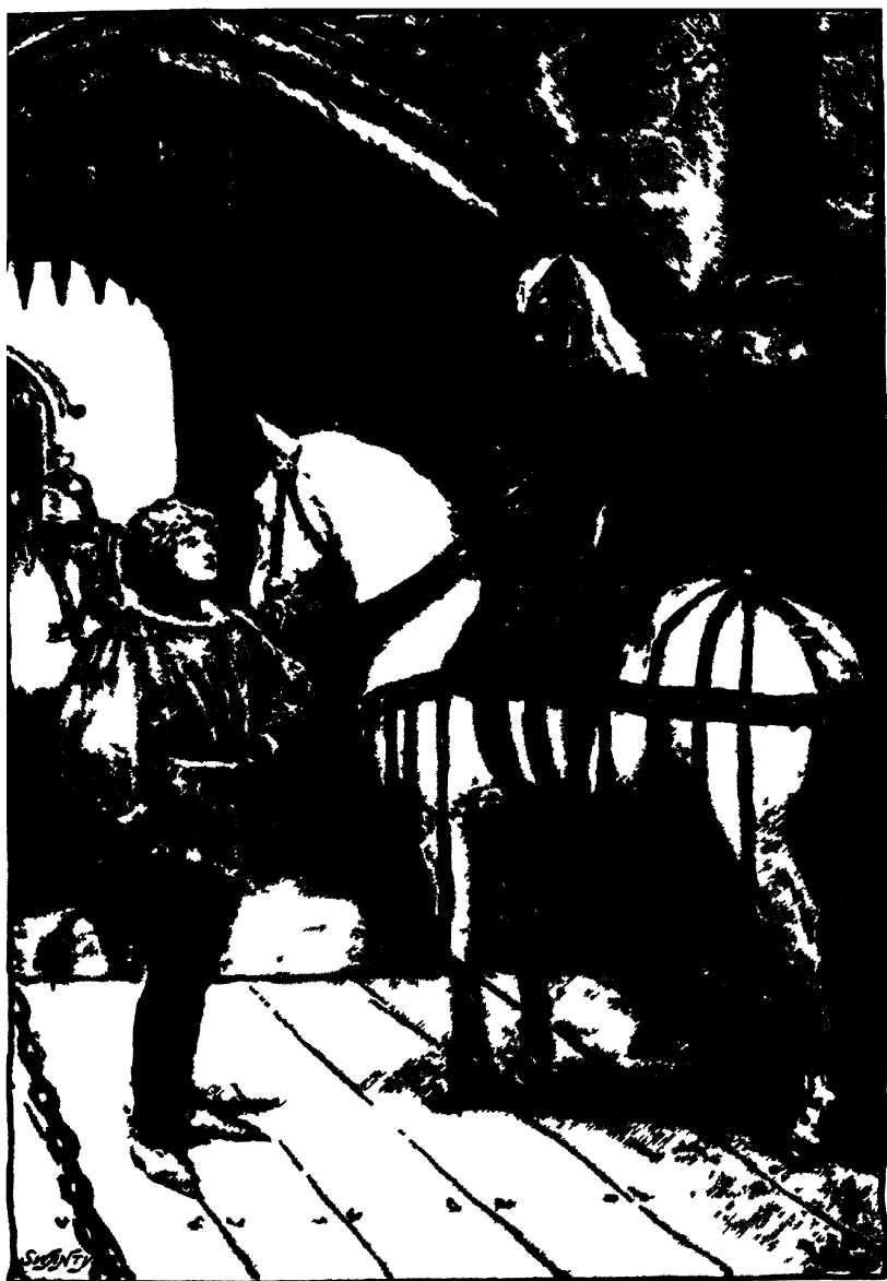
GUY WELCOMES THE COUNT OF MONTEFONE AND HIS DAUGHTER TO VILLEROY.