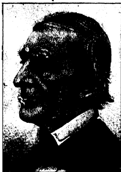
RALPH WALDO EMERSON