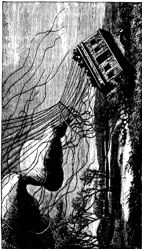
CROSSING THE COUNTRY.