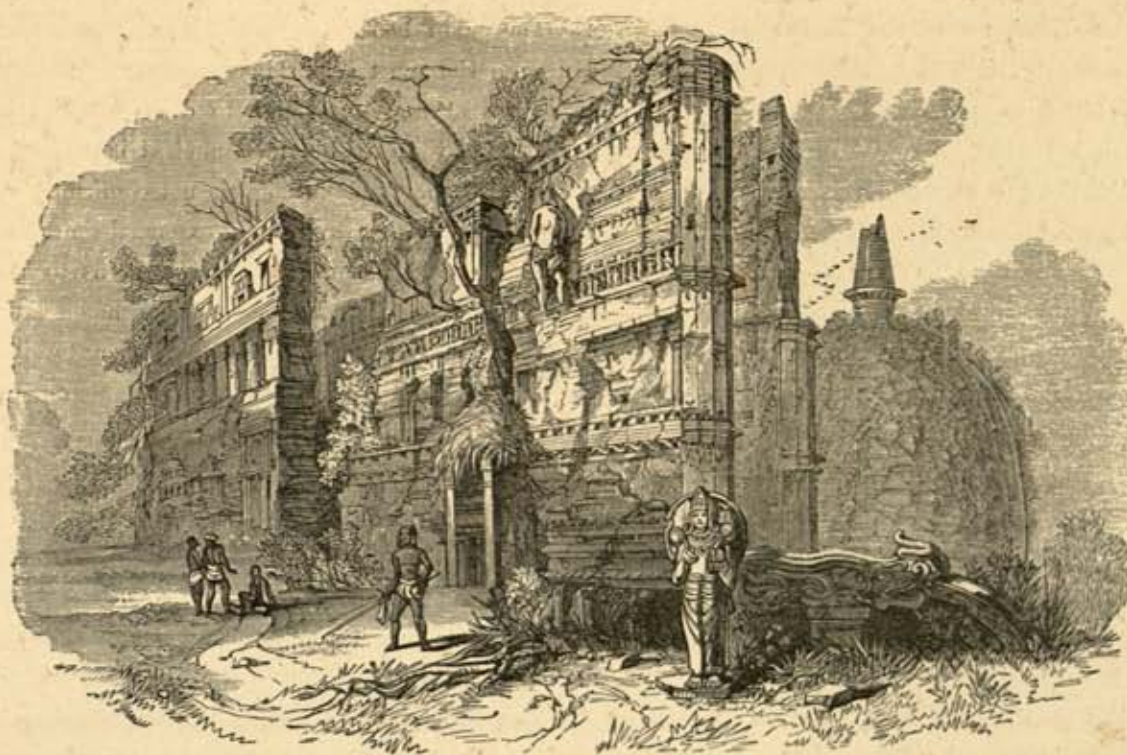
Ruins of the JETAWANÁRÁMA, a Buddhist Temple at PULASTIFURA. (See § 37.)