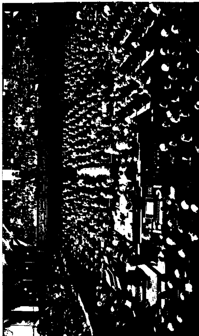
THE CONFERENCE IN SESSION