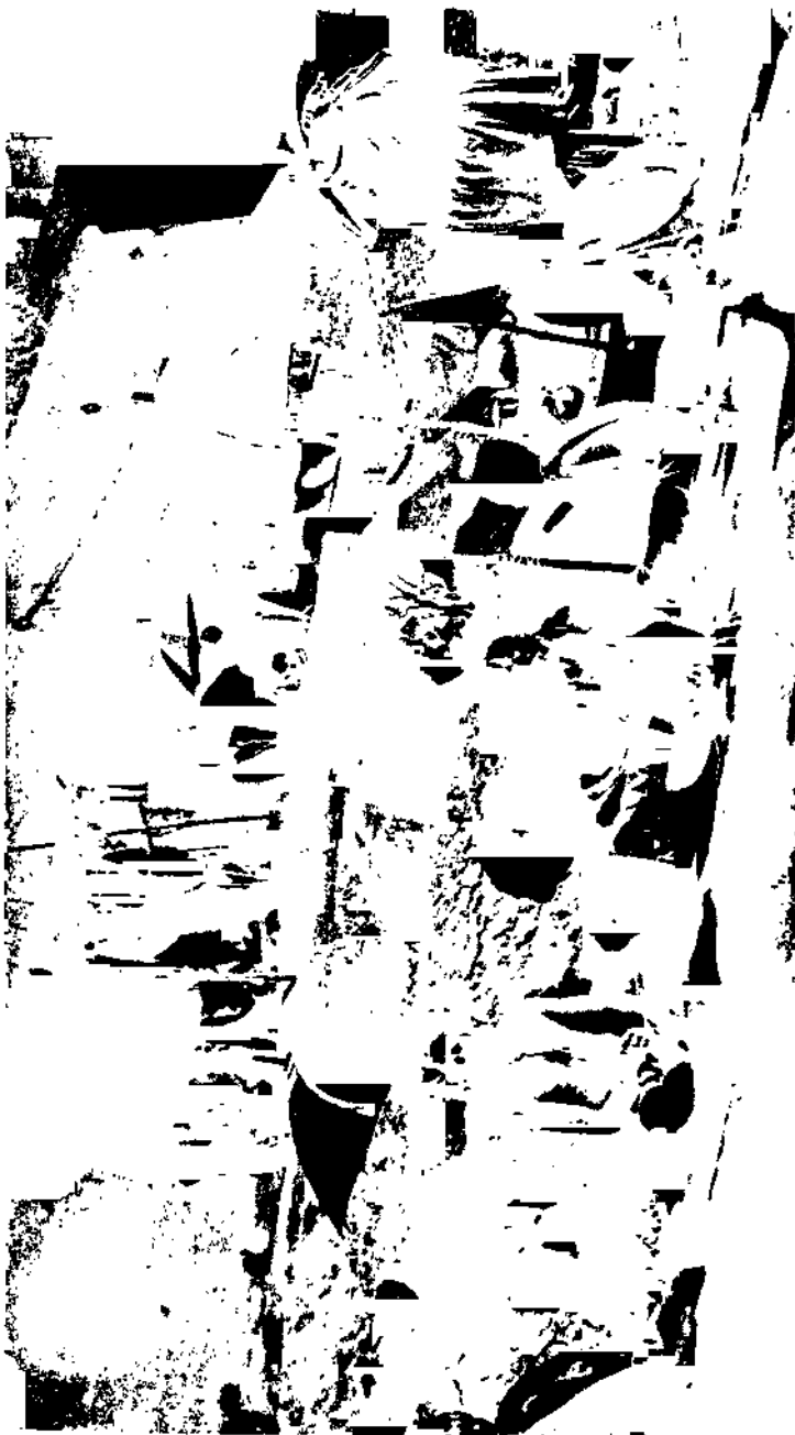
SADHS - RELIGIOS MENDICANTES AU BENIN