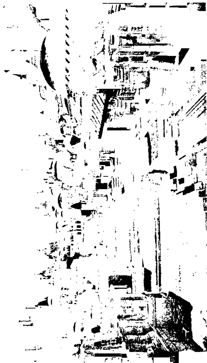
THE CITY OF THE GODS, PALTANA.