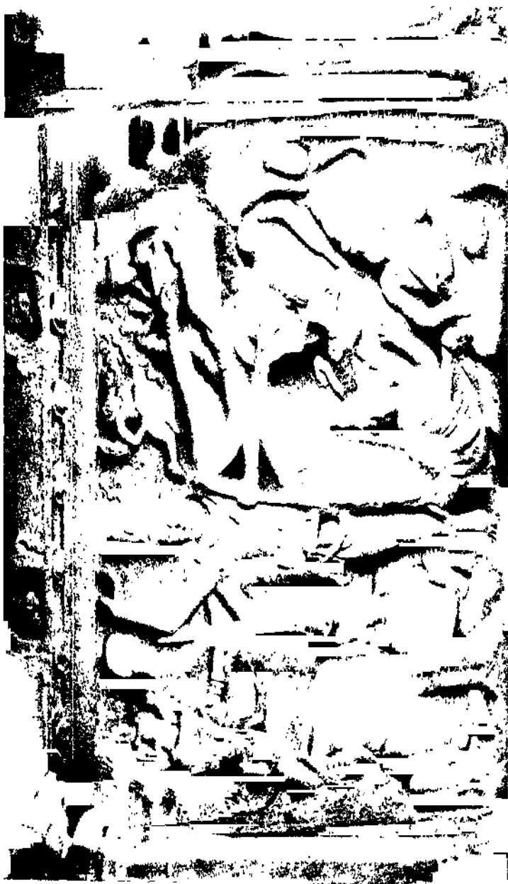
VISHNU UPHOLDING THE UNIVERSE