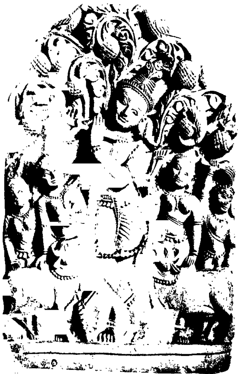
KRISHNA AND THE GOPIS HERDSMAIDS