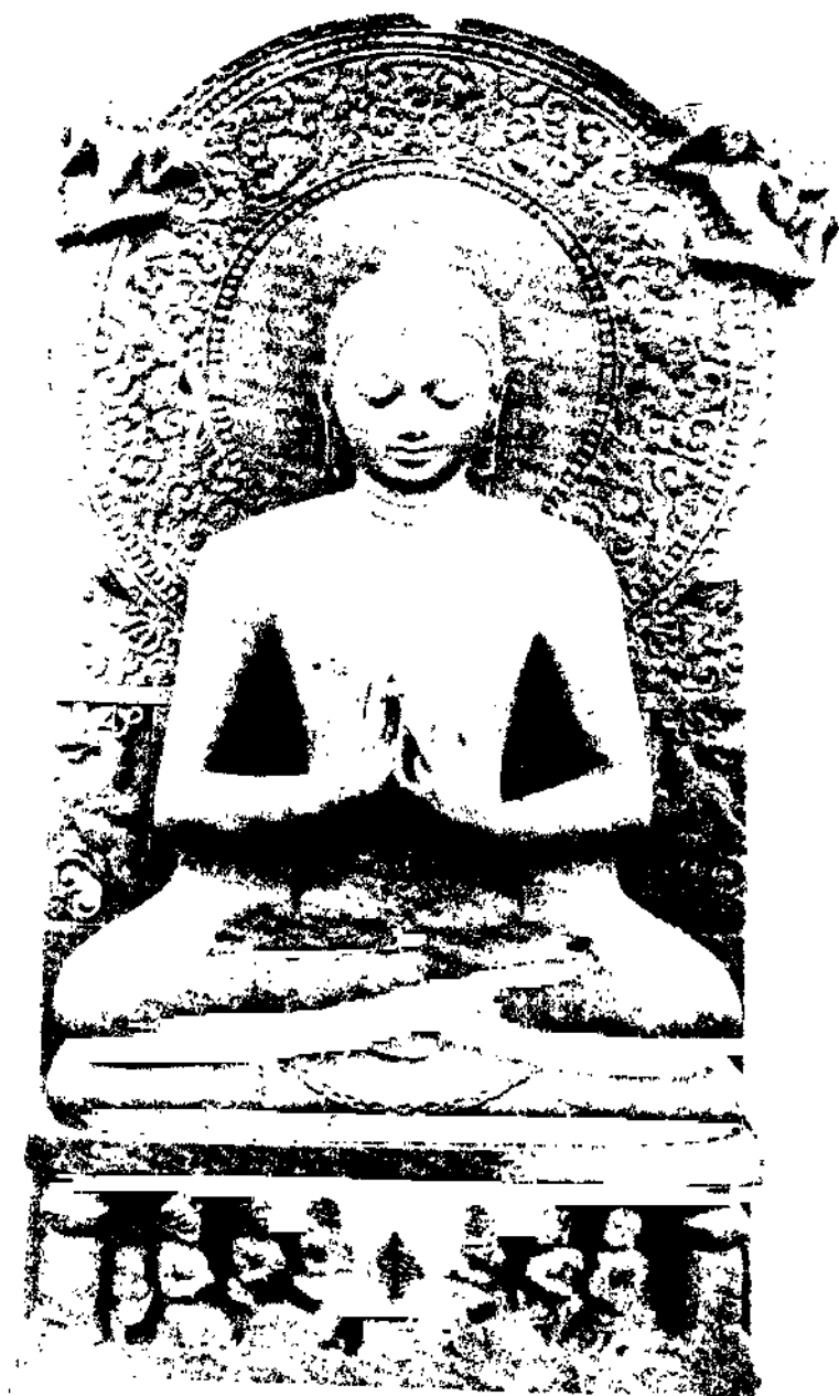
BUDDHA ENDOCKING C. 100