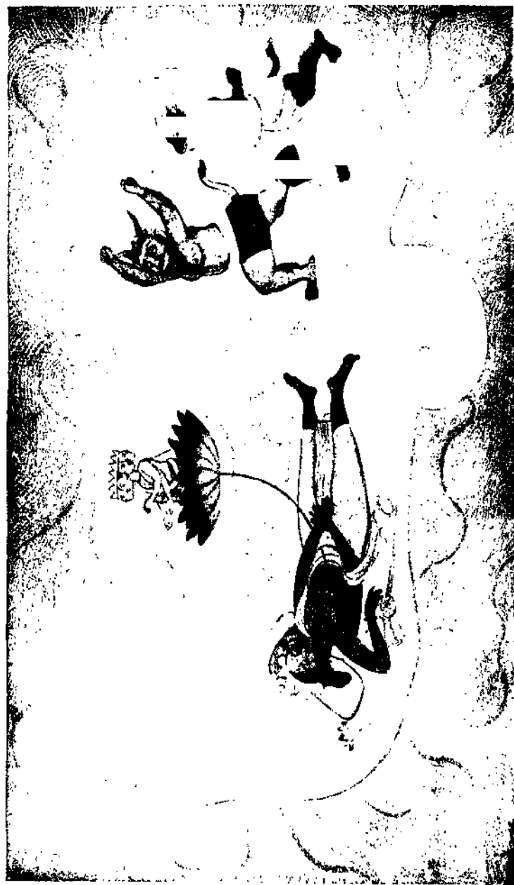
THE LEET OF RAHMA SPRING FROM A TOLUS ISSING FROM VISINDI 1902-1911