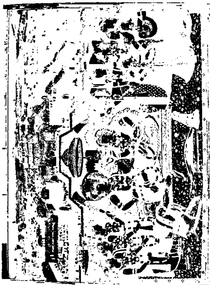
THE CORONATION OF RAMA AND SITA