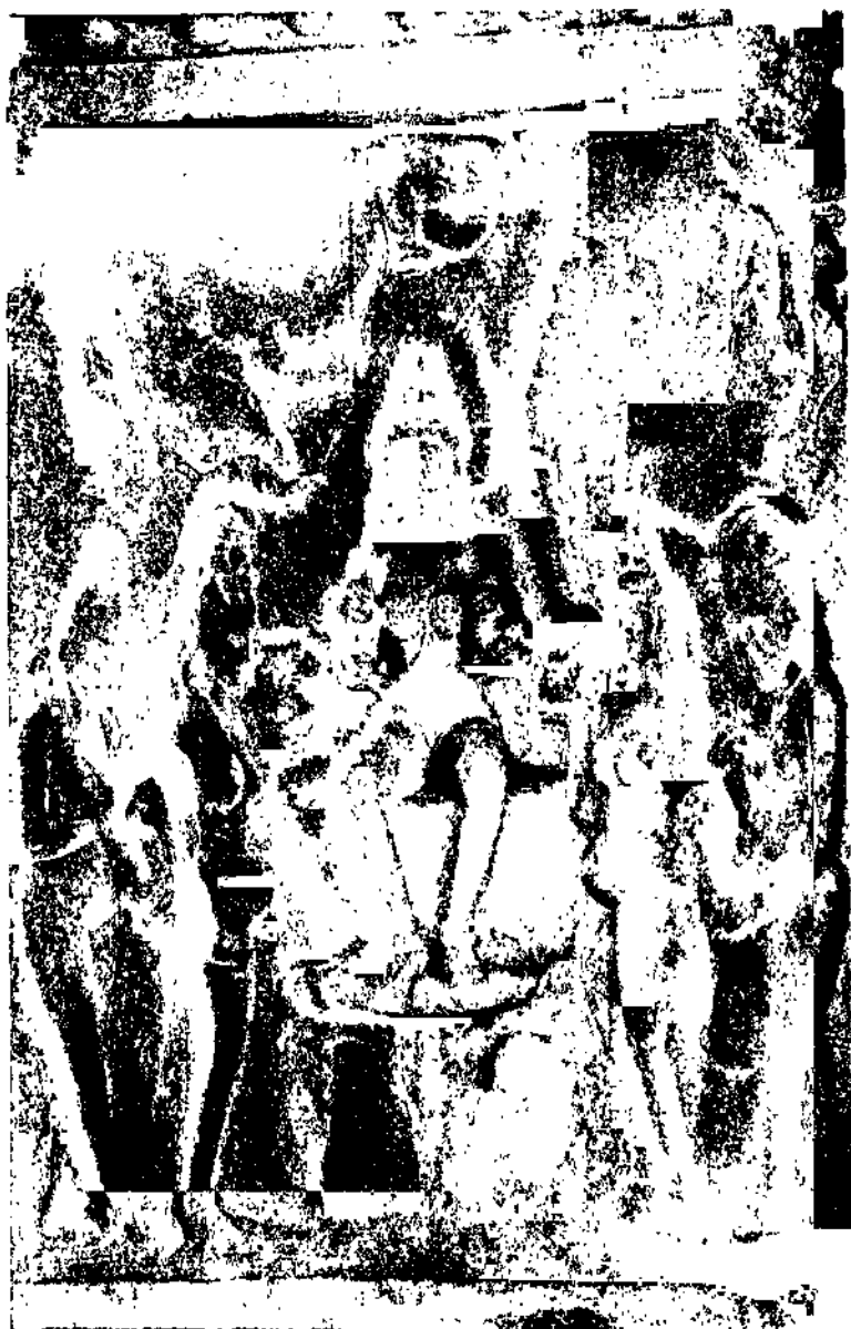
LUKSHMI ARISING FROM THE SEA OF MILK