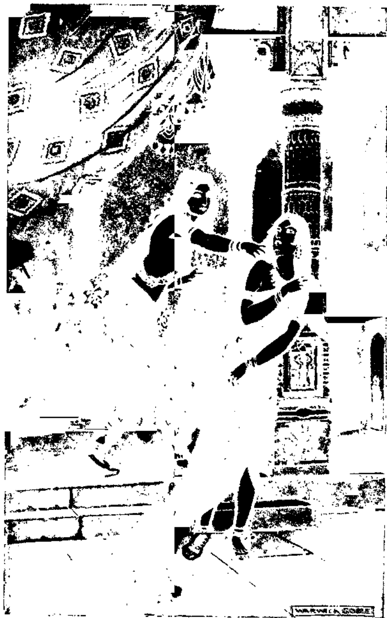
THE ORDEAL OF QUEEN DRAUPADI