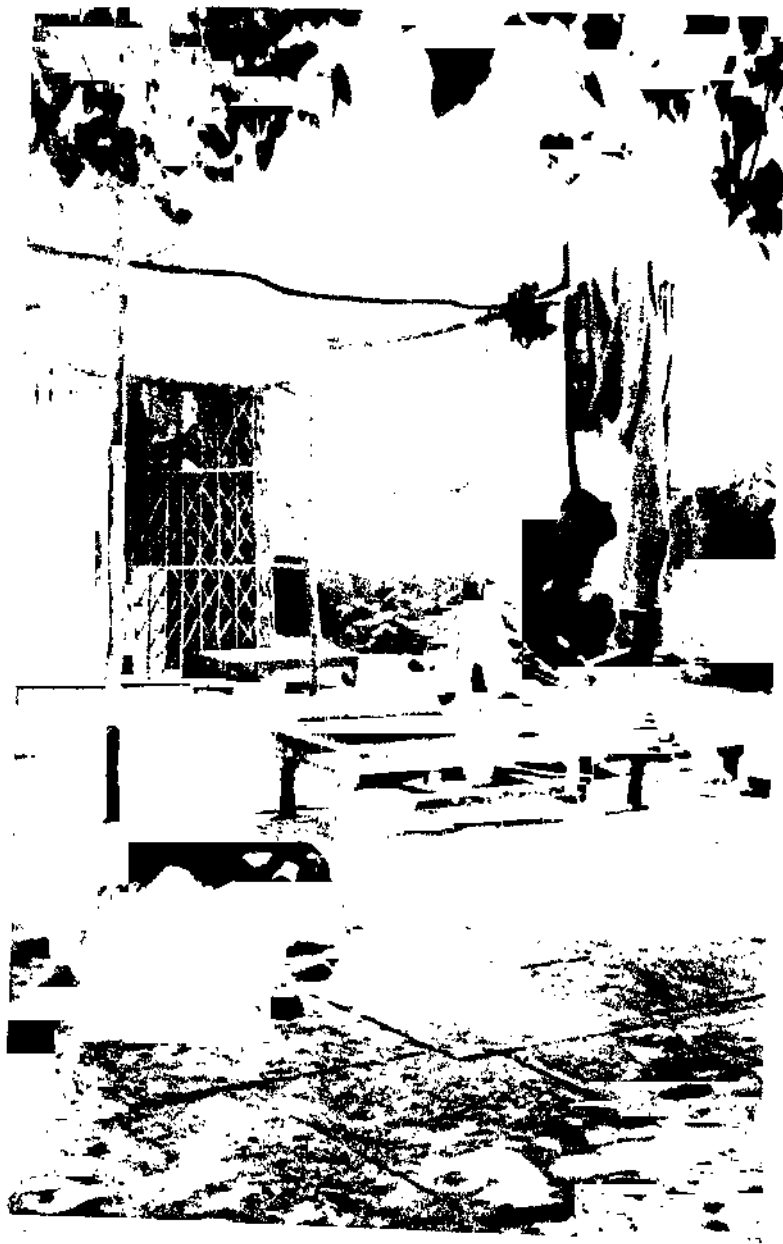
A YOGI ON A BED OF SPIKES