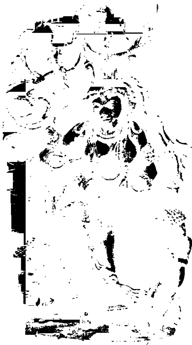
PARVATI, WIFE OF SHIVA (see page 10)