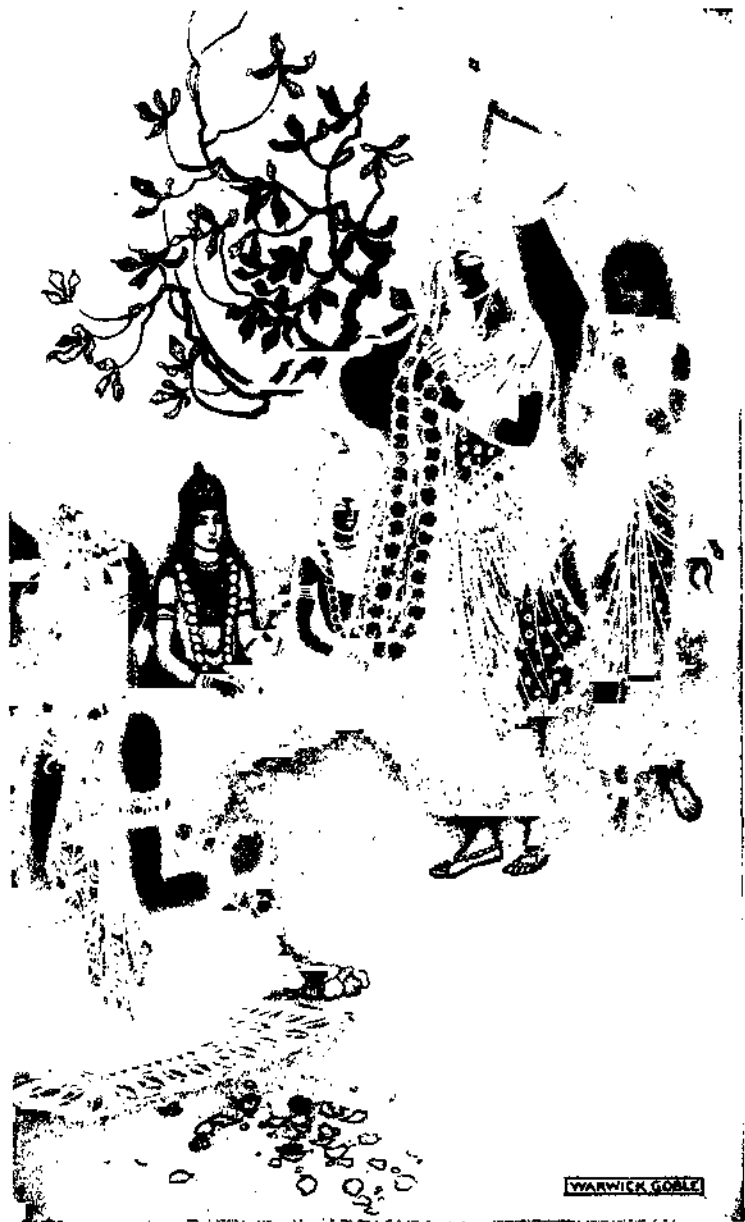
DAMAYANTI CHOOSING A HUSBAND