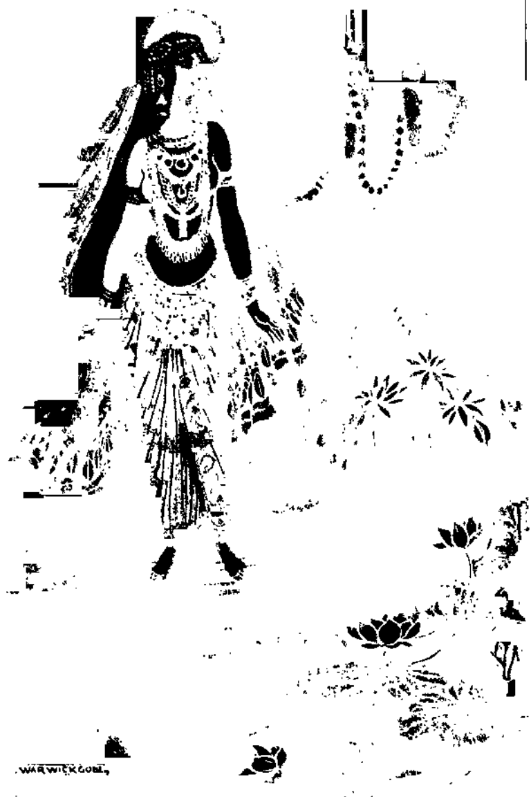
SHANTANU MEETS THE GODDESS GANGA