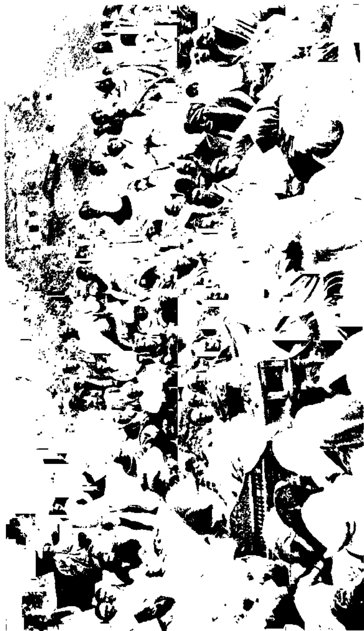
A VAYASA OR PUBLIC READER, RECITING THE MATUBHARATA