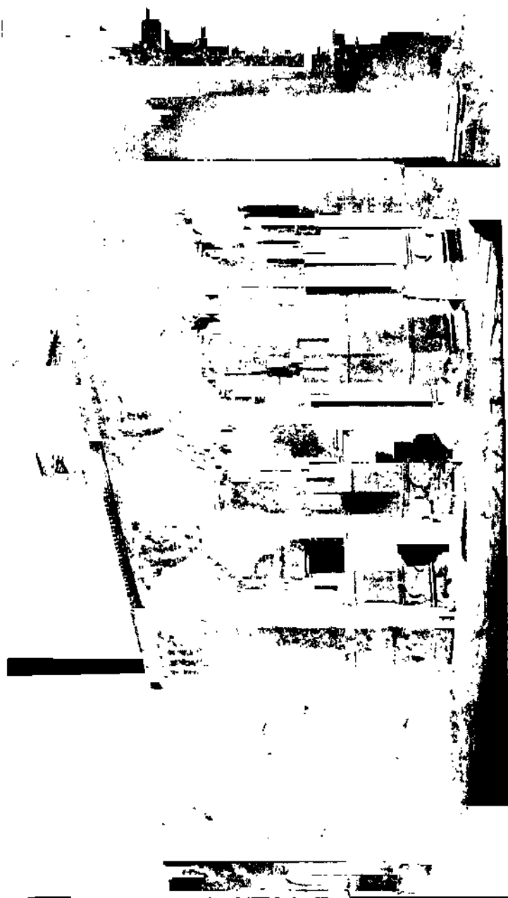
INTERIOR OF A TEMPLE TO VISHNU BRINDAVAN