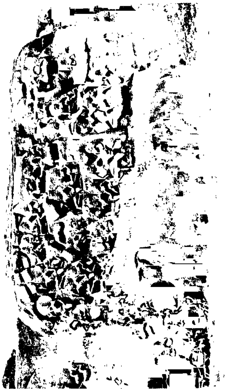
THE PARADISE OF INDRA