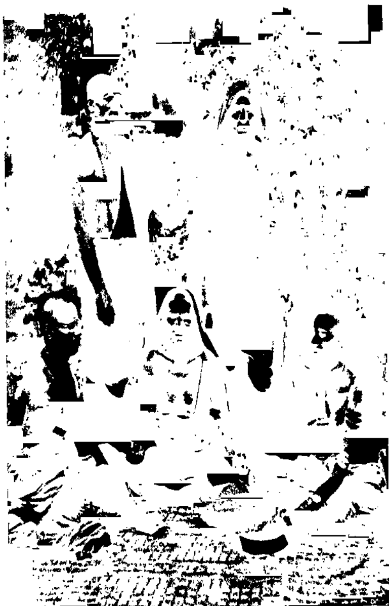
GROUP OF PRESENT-DAY BRAHMAN