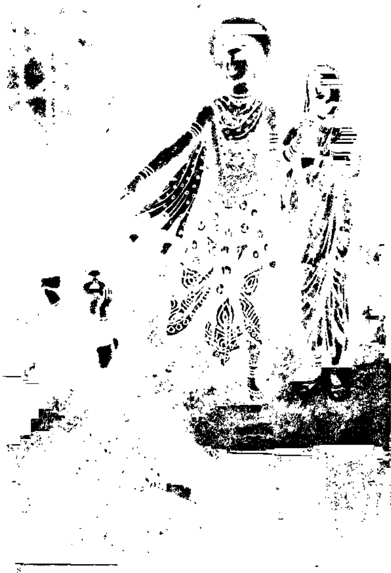
RAMA SPURNS THE DEMON LOVER