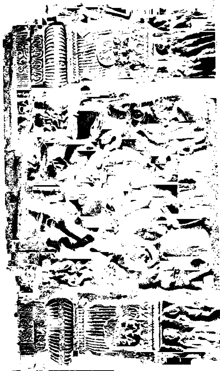
SHIVA'S DANCE OF DESTRUCTION, ELLORA (see pages 147-8)