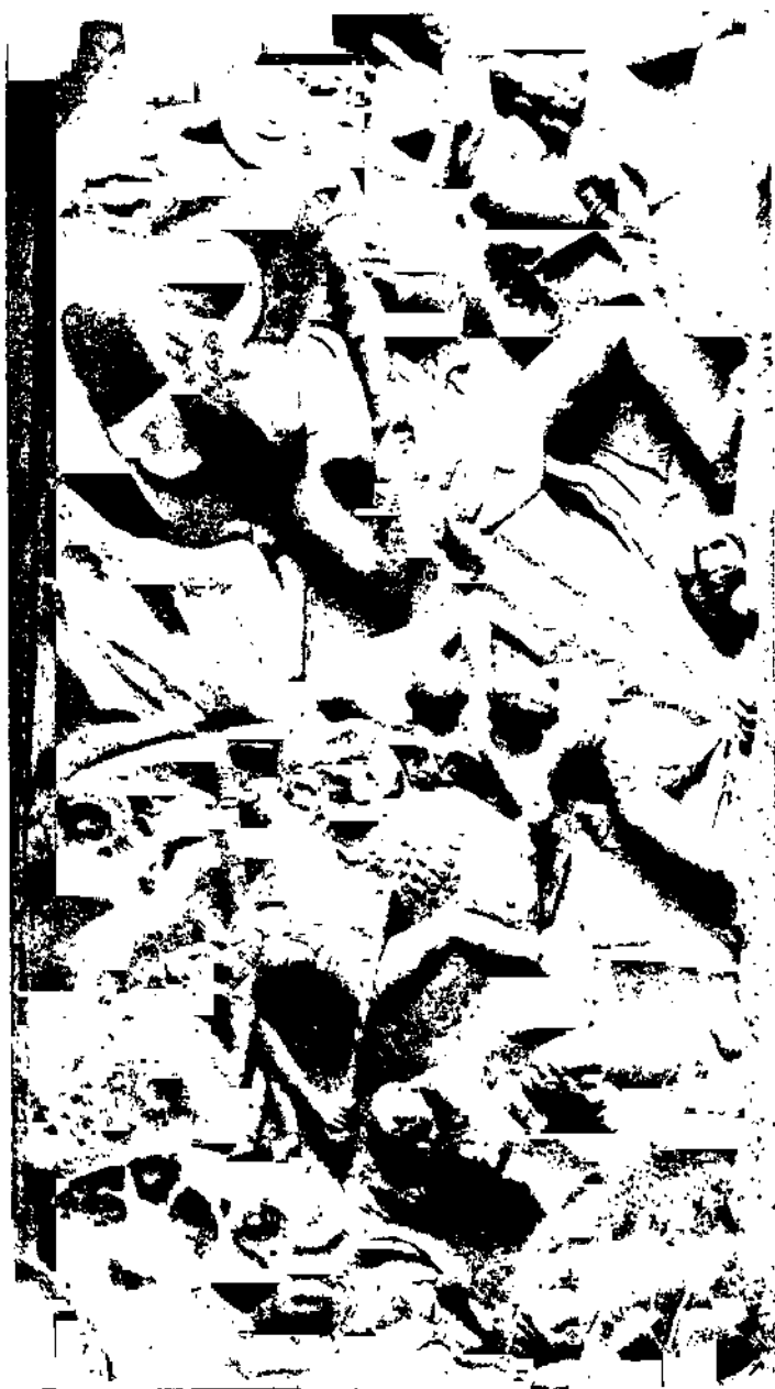
DURGA SLAYING GIANTS AND DEMONS