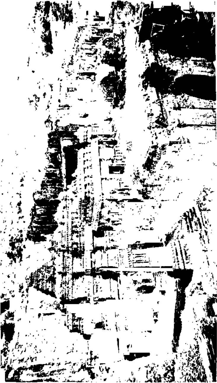
THE KAILASA TEMPLE OF SHIVA ELLORA