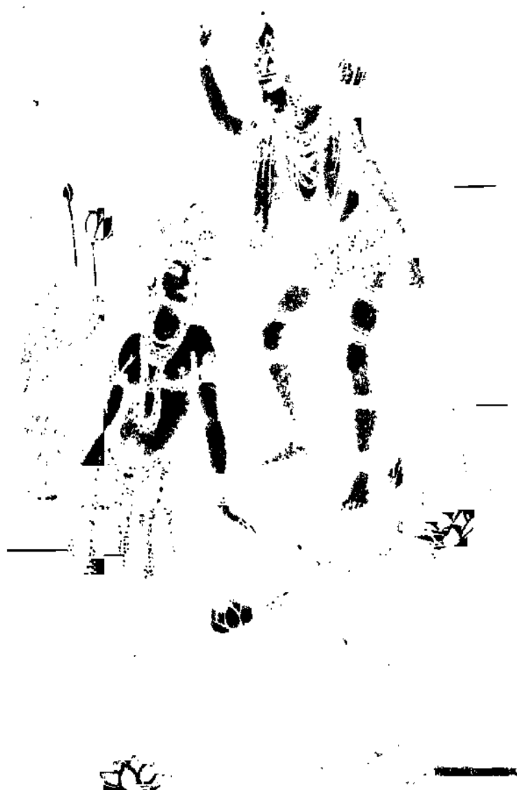
ARJUNA AND THE RIVER NYMPH