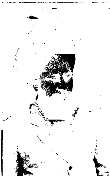
Hazrat Mirza Bashir ud-Deen Mahmud Ahmad, Second Successor of the Promised Messiah, and Head of the Ahmadiyya Community.