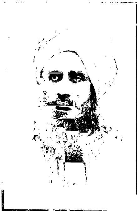
Hazrat Maulawi Noor-ud-Din, First Successor of the Promise Messiah.