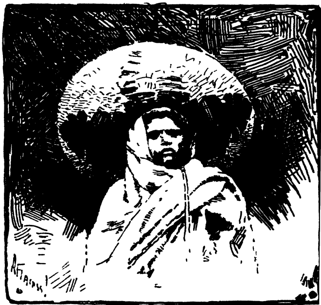
STRAW HAT OF THE DJERID ORNAMENTED WITH COLOURED TRIMMINGS.