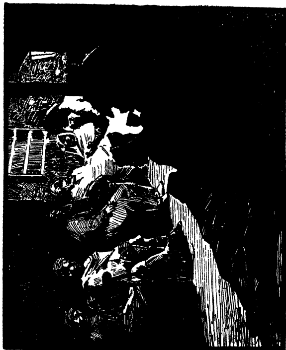
SCENE IN BAZAAR THE STORY-TELLER