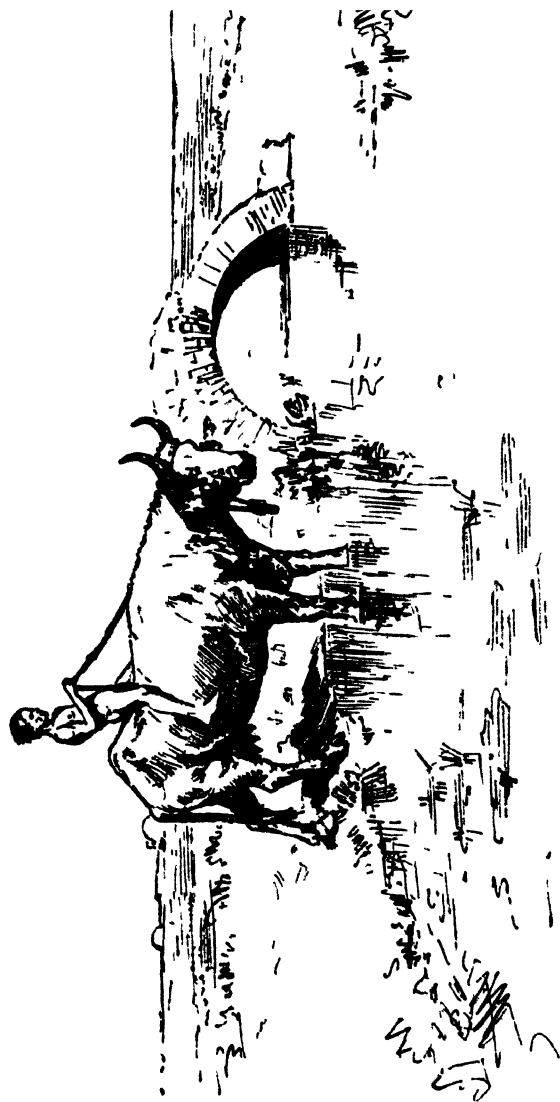
ON THE SAHEL. SIDI EL HANI IN THE DISTANCE.