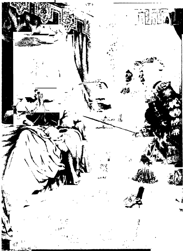
The Marquise is forced by the Abbe and Chevalier de Ganges to make choice as to the means of her death. —THE MARQUISE DE GANGES.