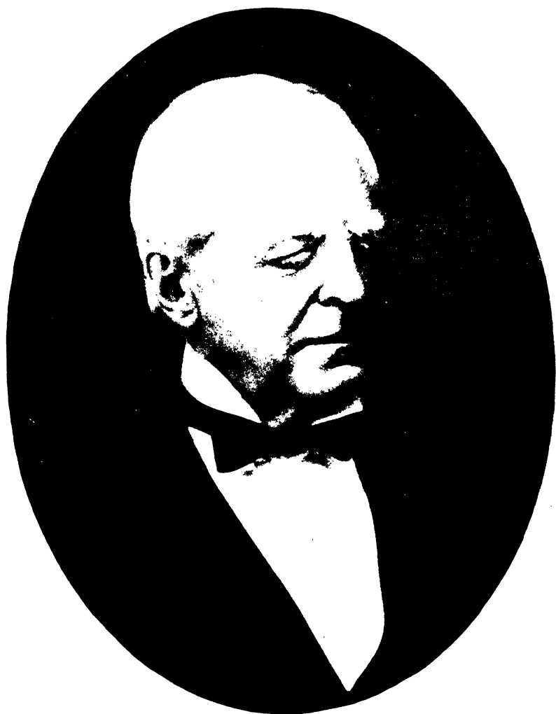
ROBERT LOWE. (VISCOUNT SHERBROOKE).