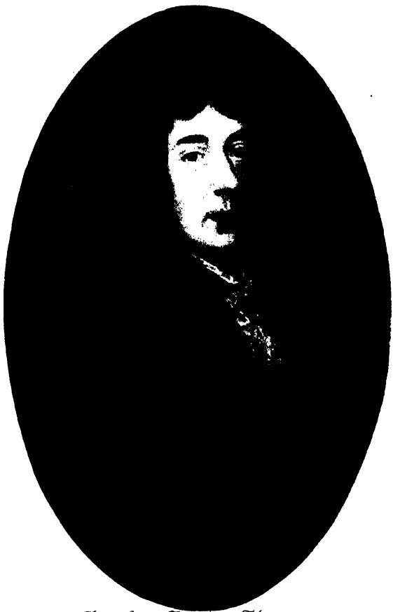
The Lord Advocate Mackenzie after the Picture by Kneller in the Parliament House, Edinburgh