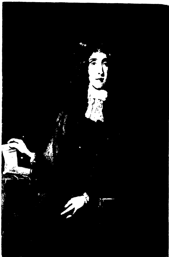
Jeffreys as Recorder of London c.1710 after the Picture by Kneller in the National Portrait Gallery of London