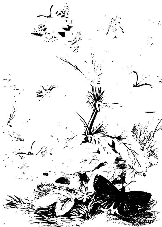
1. Grasshopper Skipper 2. Long Skipper 3. Chequered Skipper 4. Small Skipper