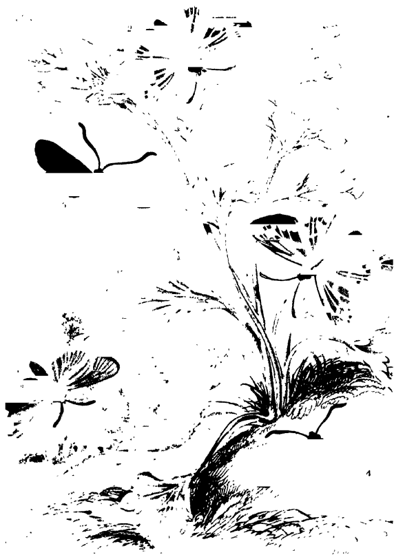
1. Larrea tridentata 2. Prosopis juliflora 3. Acacia greggii 4. Sesuvium portulacastrum 5. Portulaca greggii