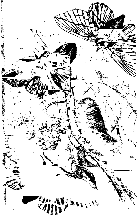
1 & 2 Drucker Moth male & female 3 Lappet Moth 4 Caterpillar of 10