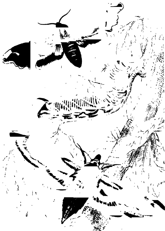
1. Lime Hawk moth 2. Privet Hawk moth 3. Caterpillar of Privet Hawk moth