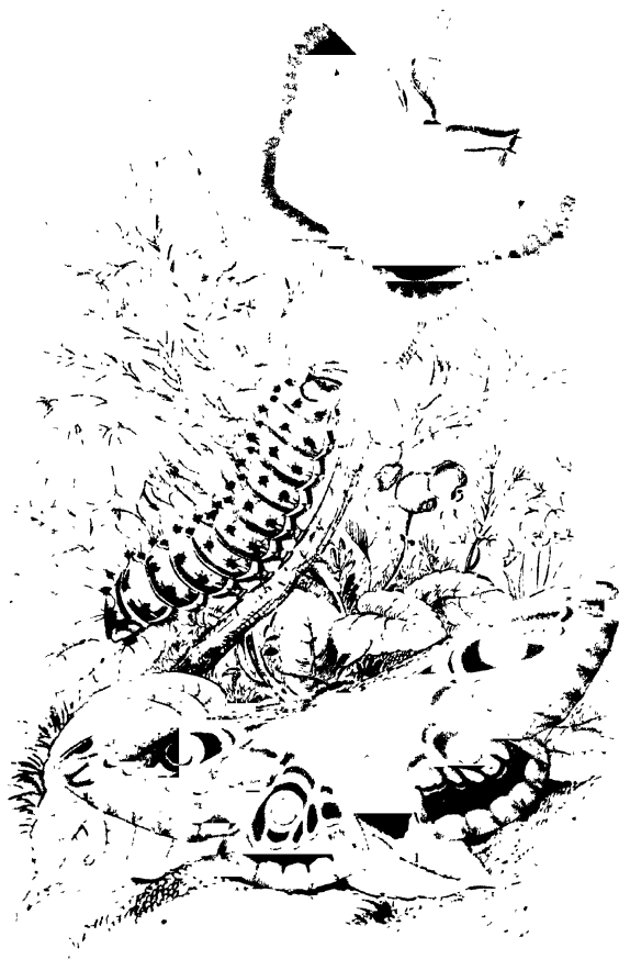
Empidon carolinensis (Red-tailed Hawk) on Oak Ridge at the