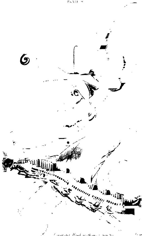
Cranioides Black in the middle of the