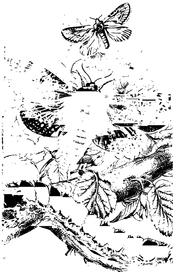
* 1 Orana Swiff 2 Goat Moth "Caterpillar at top"