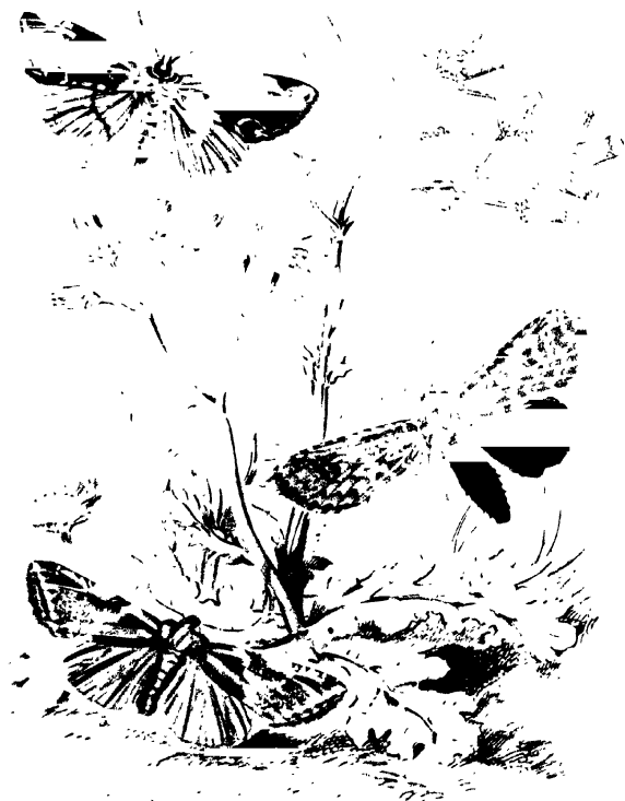
1. Apoll. Mischka 2. Parachlorissa Moth 3. Pyg. Archer