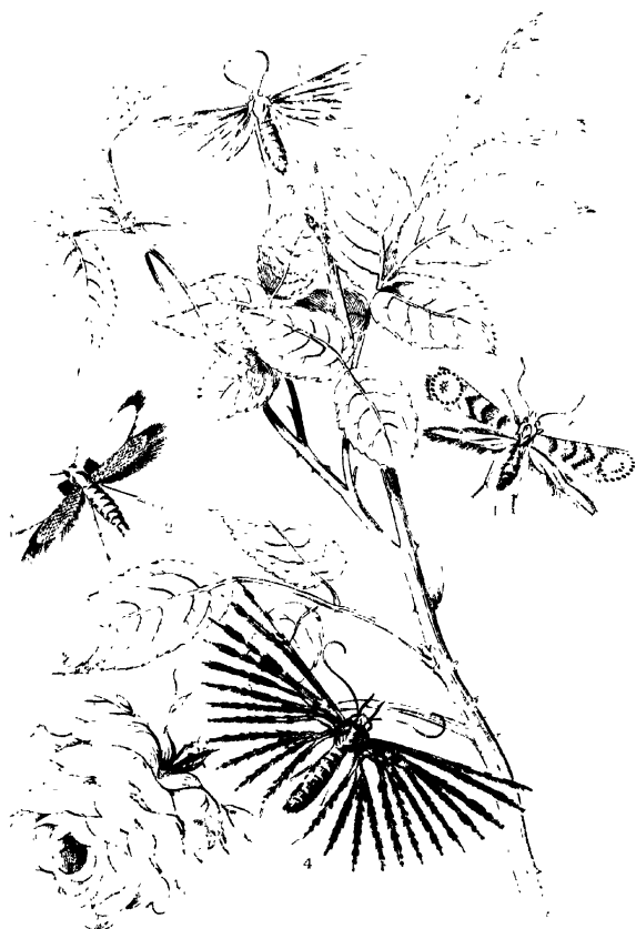
1. The Dark porcelain Moth 2. White porcelain Moth