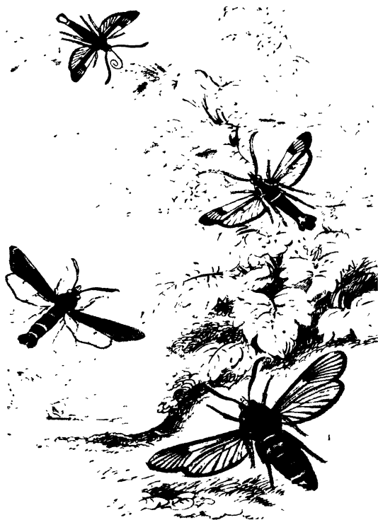
1. Bee Clear wing 2. Breeze Clear wing