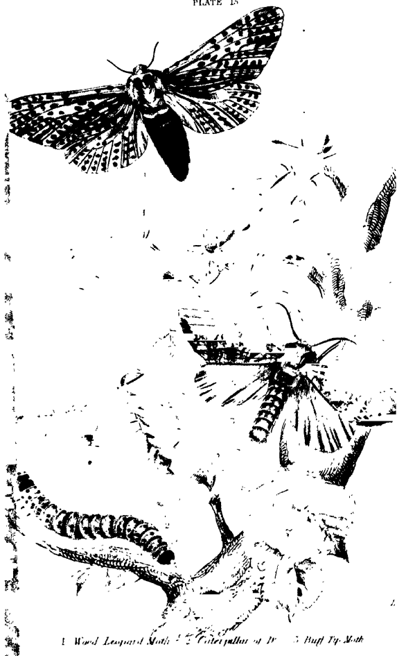
1 Wood Leopard Moth 2 Caterpillar of 1 3 Buff Tip Moth