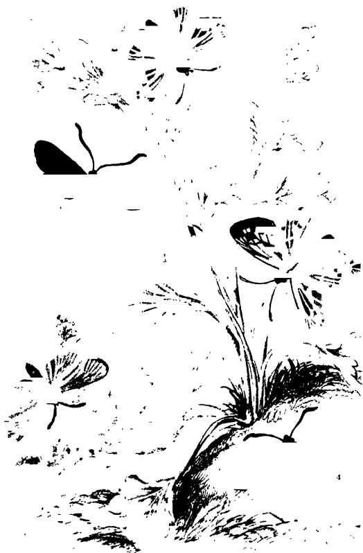
1. L. siphonifera 2. L. siphonifera 3. L. siphonifera 4. L. siphonifera 5. L. siphonifera 6. L. siphonifera