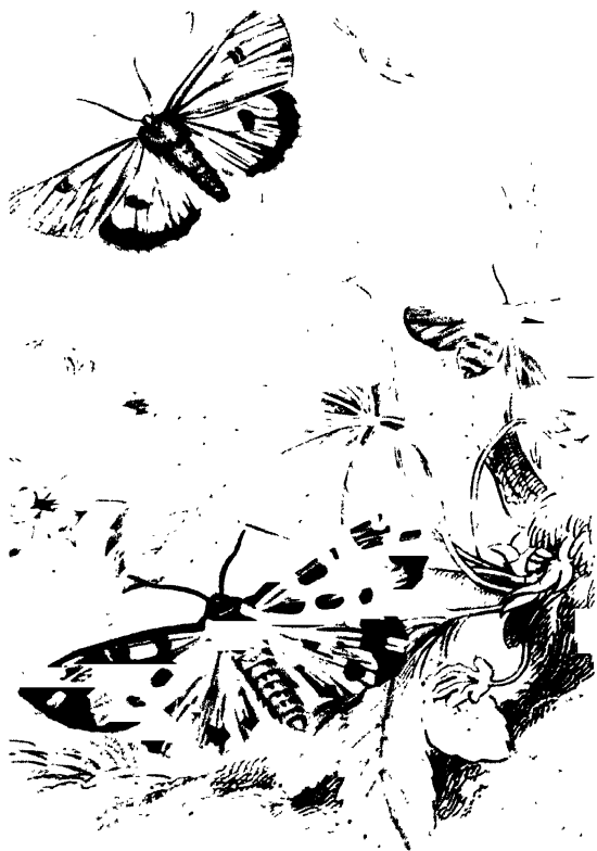
1 Clouded Bayl 2 Cream-colored Tiger Moth 3 Ruby Tiger Moth