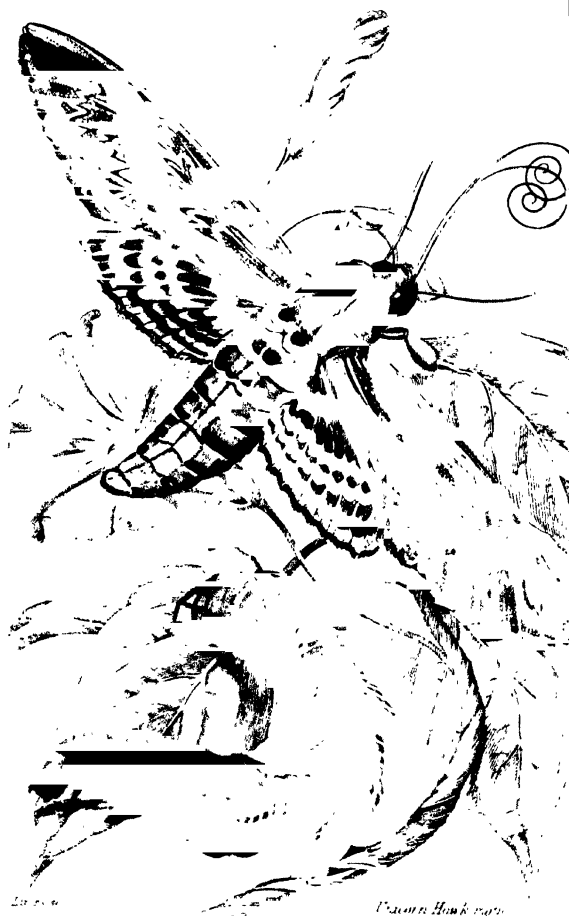
Paeonia Hawk moth