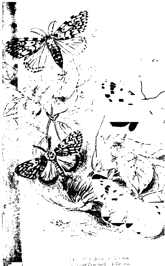
Vanessa atalanta L. (Dorsal) Vanessa atalanta L. (Ventral)