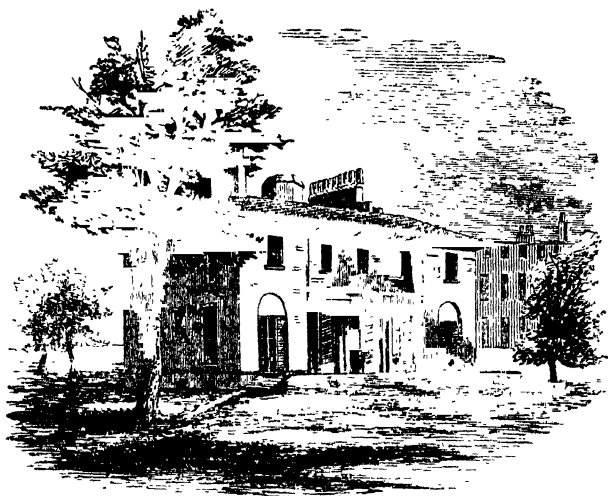
HOUSE IN TAVISTOCK PLACE IN WHICH MR. BAILY WEIGHED THE EARTH.