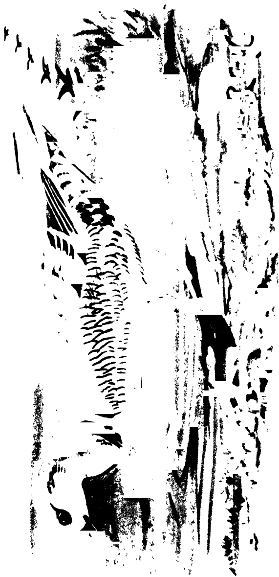
COTTON TEAL ( Nettapus coromandelianus ).