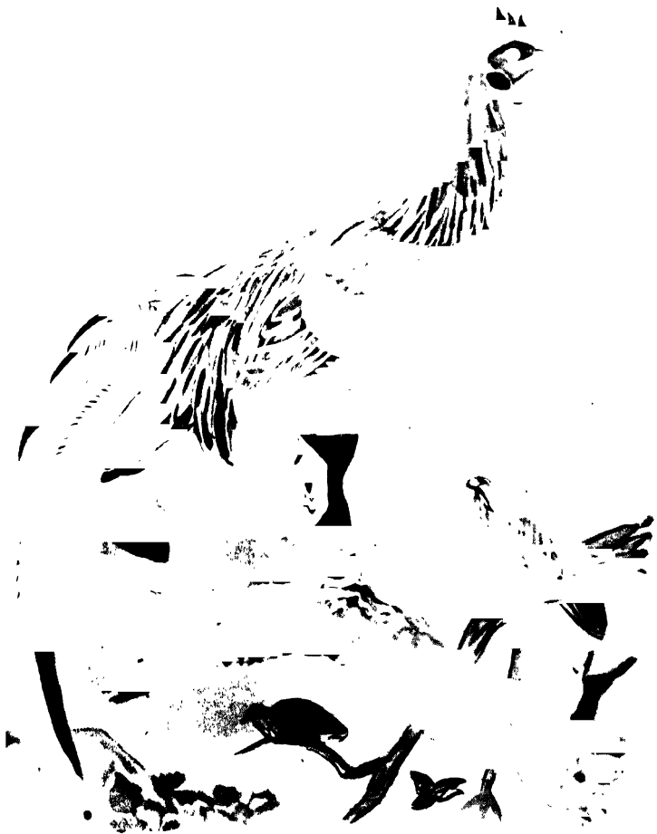
INDIAN JUNGLE FOWL ( Gallus bankiva ).