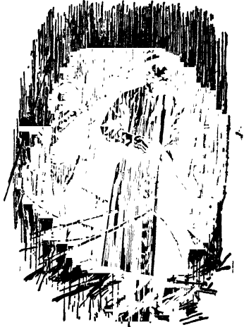
The Burberry. Reliably weatherproof, air-free, and airylight

A handbook on the subject of equipment, and patterns of Gabardine, post free on request.