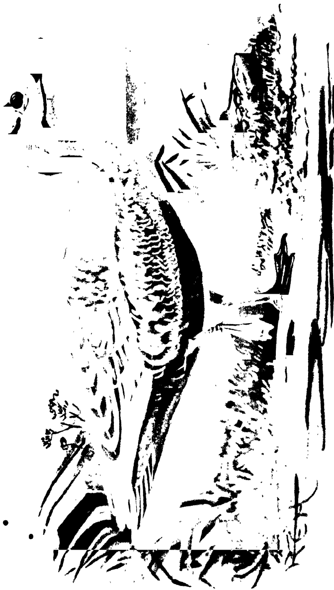
BAR-HEADED GOOSE ( Anser indicus ).