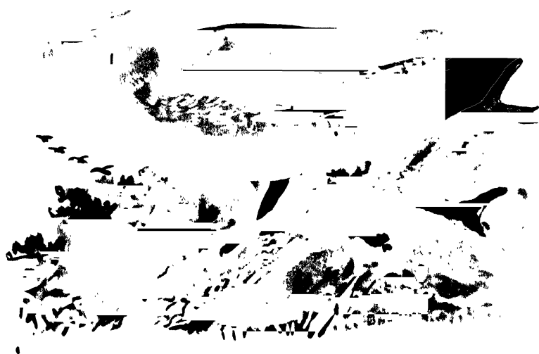
GREEN PIGEON ( Crocopus chlorogaster ).