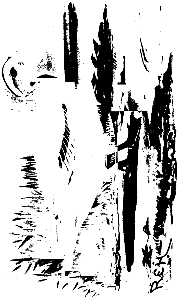
RUDDY SHELDRAKE OR BRAHMINY DUCK ( Casarca rutila ).