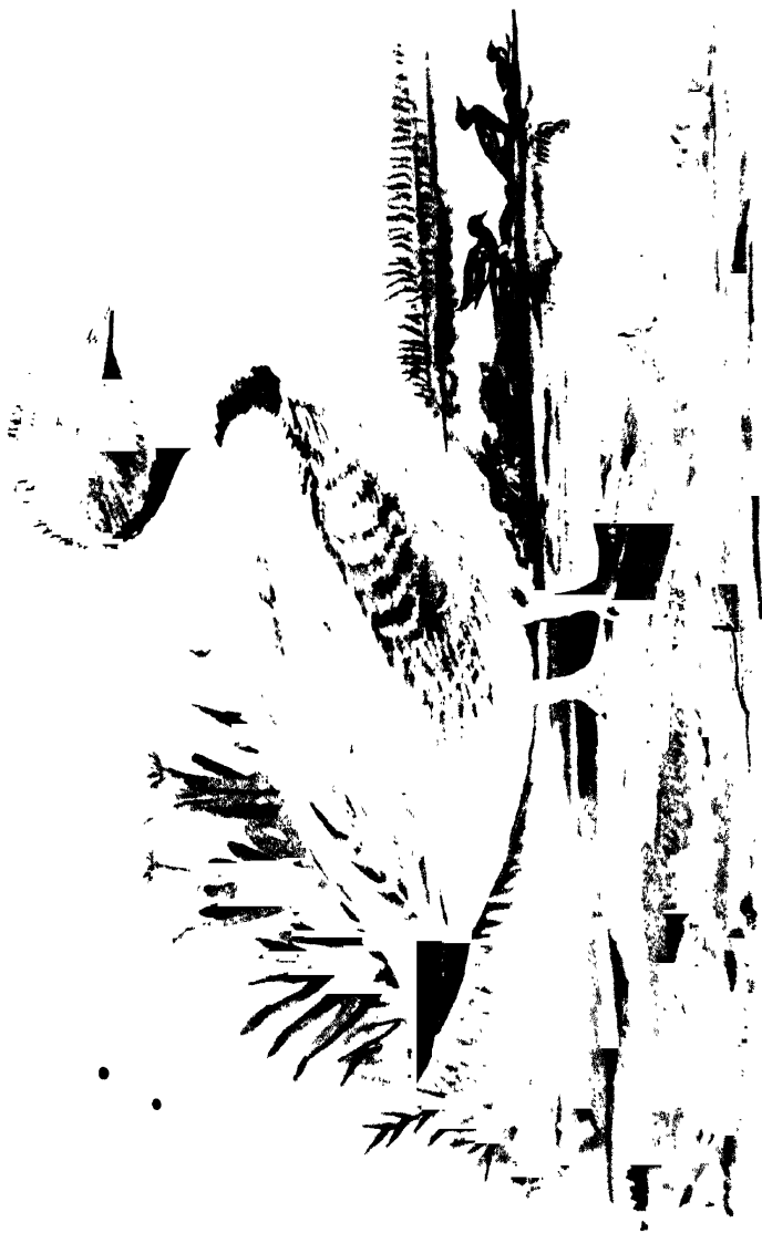
RED-CRESTED POCHARD ( Fuligula rufina ).