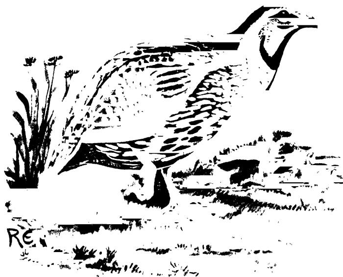
RAVI QUAIL ( Coturnix coturnix )