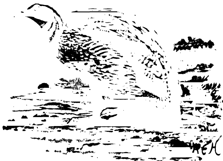
GREY OR COMMON QUAIL ( Coturnix communis ).