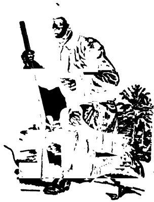
Gabardine Suit. Ideal for rough sport and hard wear.

Haymarket; LONDON; Bd. Malesherbes, PARIS; Cities throughout the World.