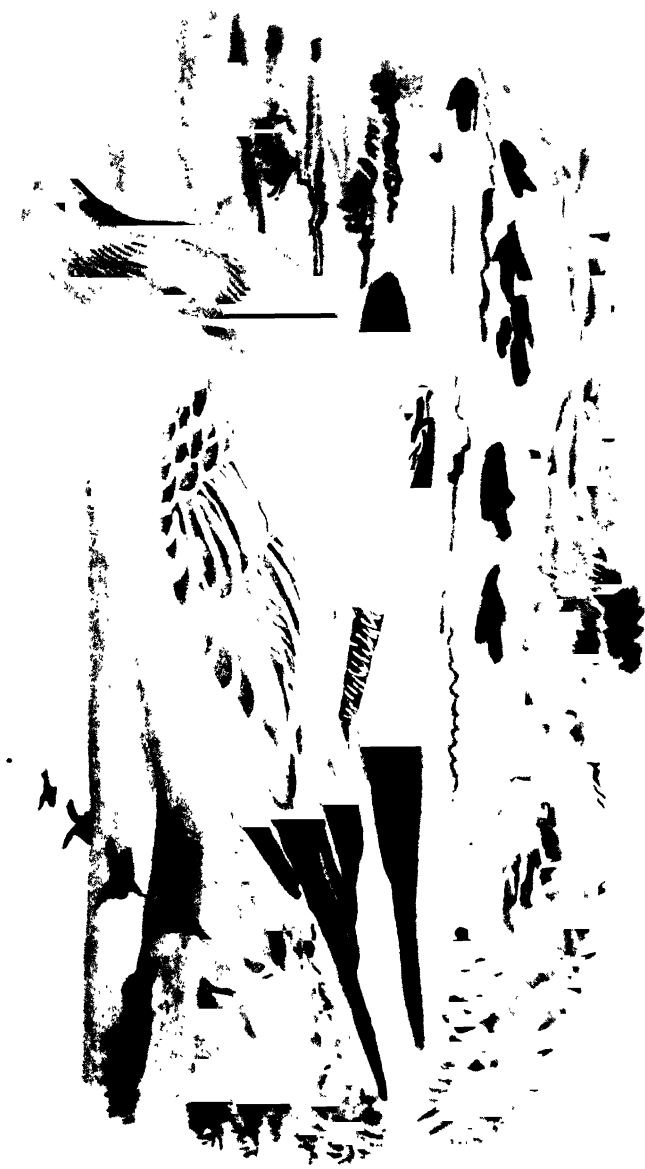
COMMON SAND-GROUSE ( Pterocles exustus )