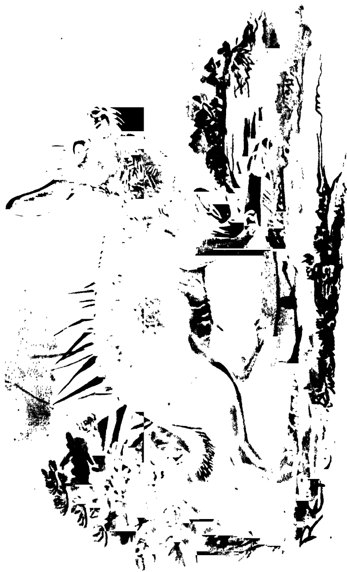
INDIAN HARE ( Lepus ruficaudatus ).