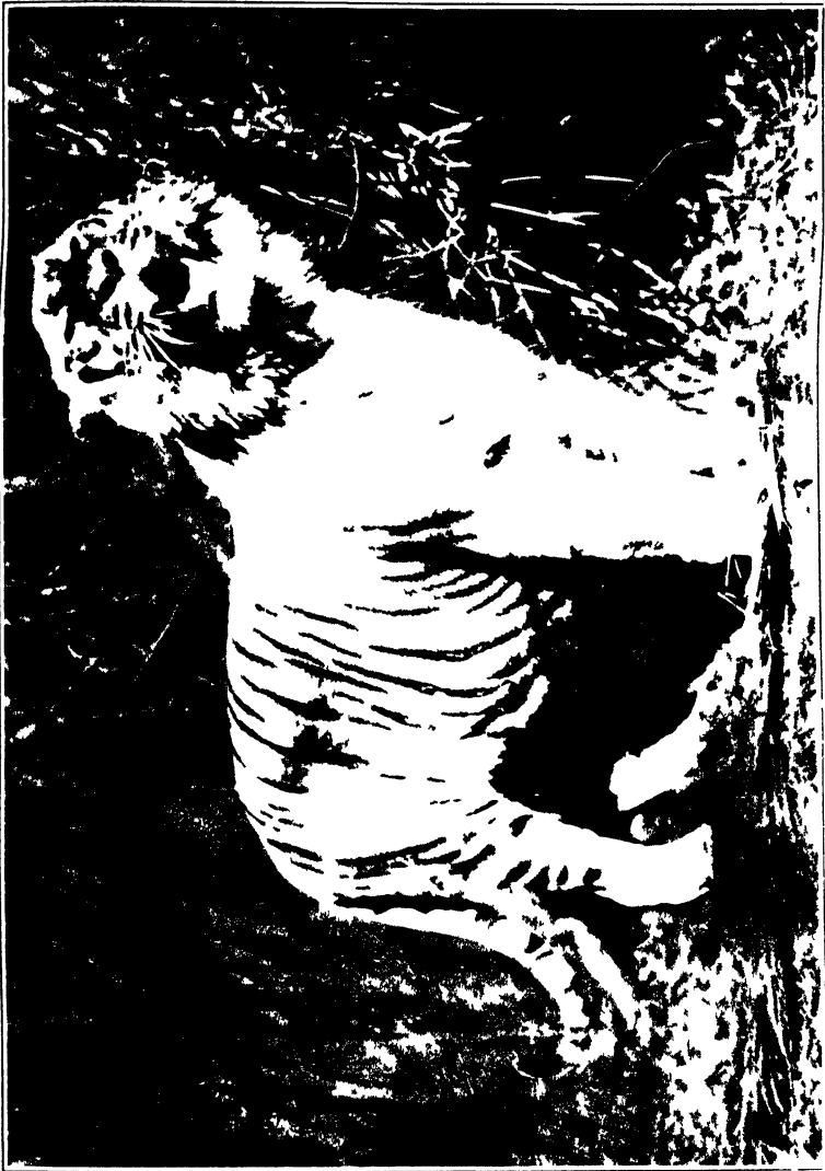
A TIGER AT REST IN THE JUNGLE