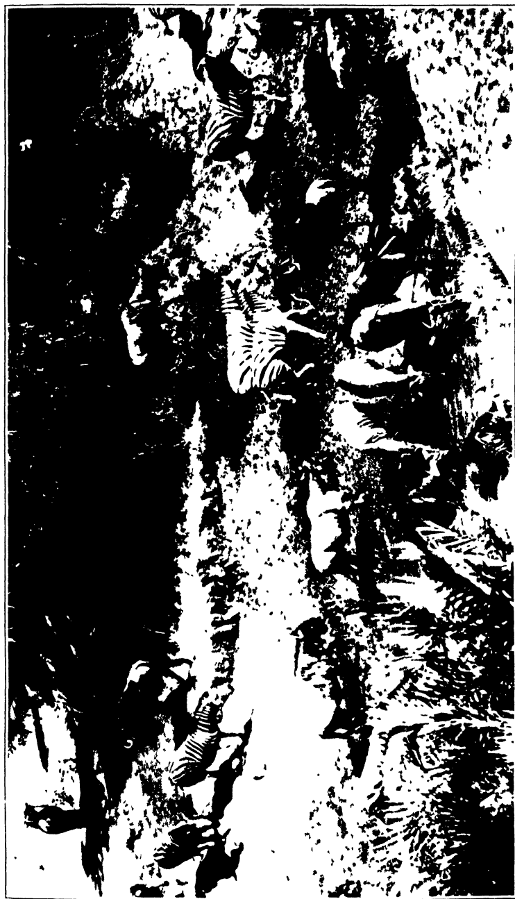
A TIME AT A MARKET PLACE IN AFRICA