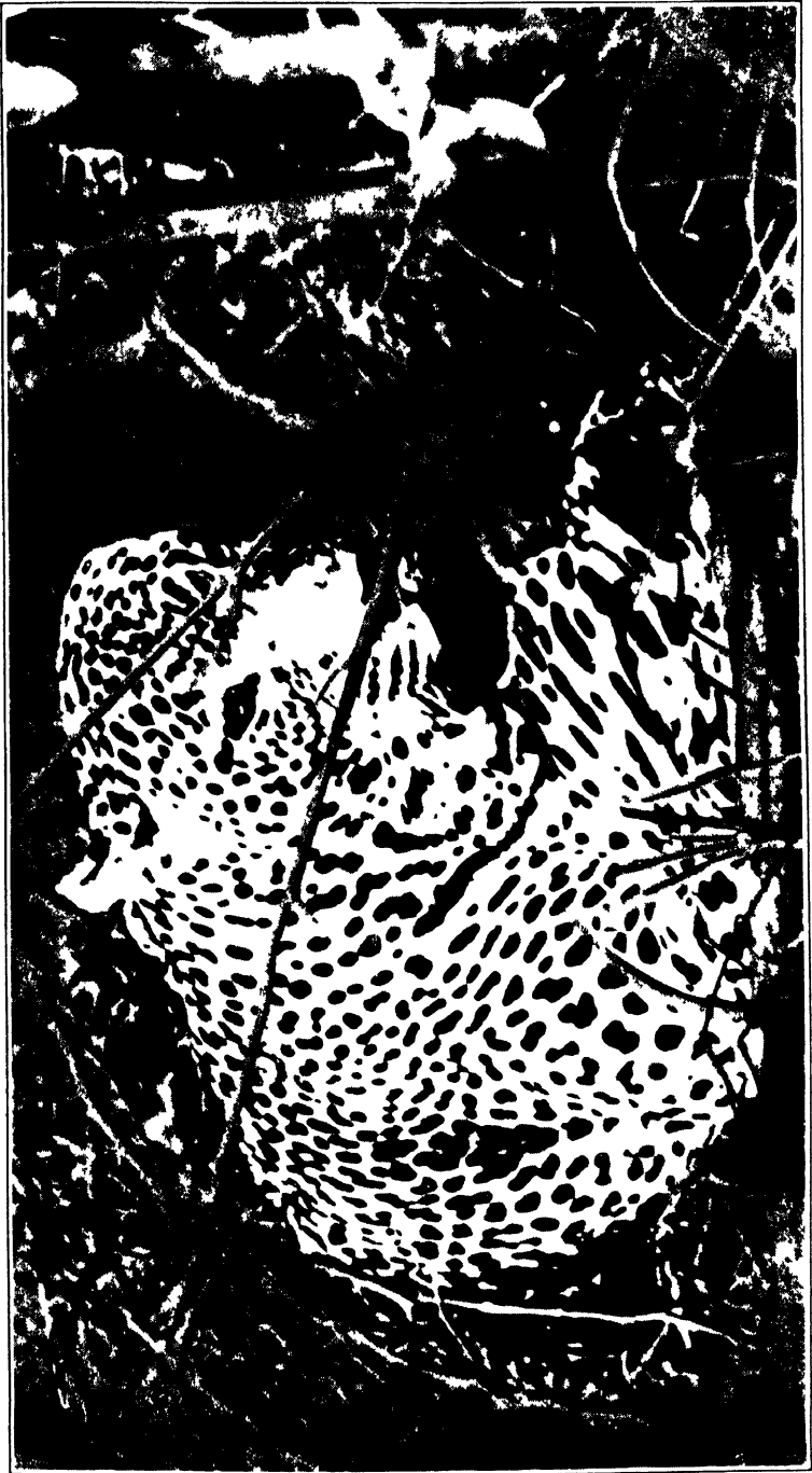
LEOPARD IN THE JUNGLE