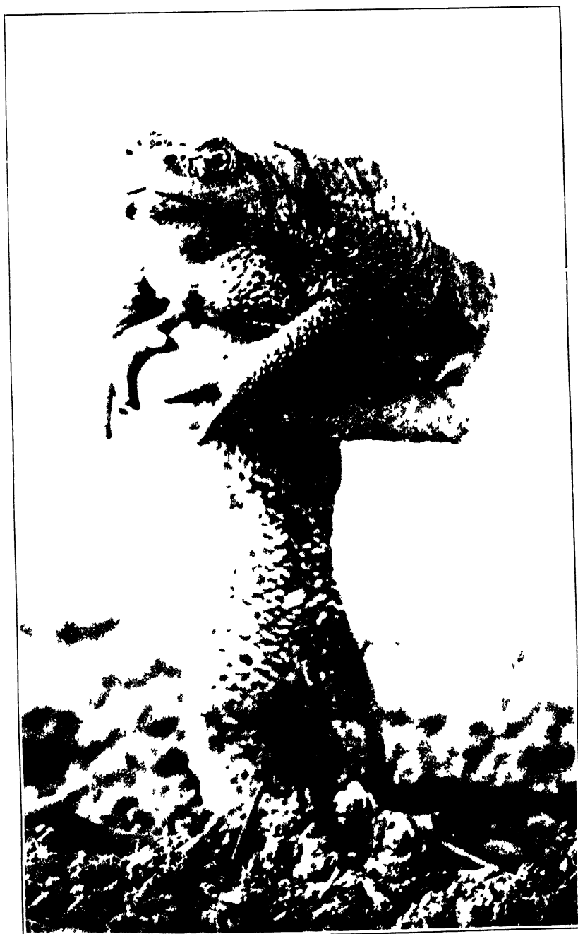
A UNIQUE AND INTERESTING PHOTOGRAPH OF A FOSSIL