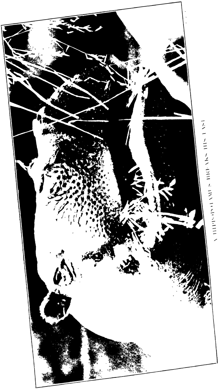
A HIPPOPOTAMUS BREAKS HIS FANGS