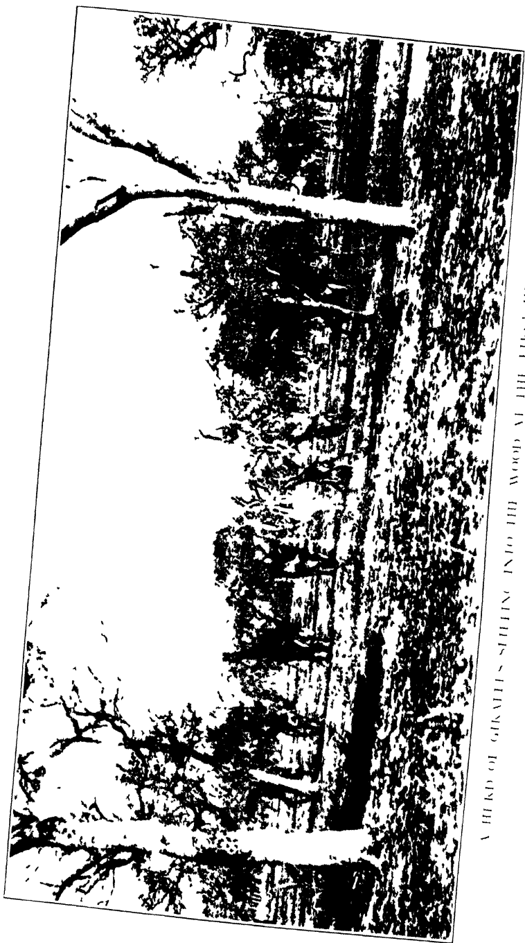
A HAND OF GIANTS STEPPING INTO THE WOOD AT THE FIRST HINT OF DANGER