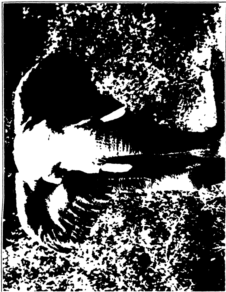
AN ELEPHANT CHARGING