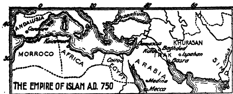
Map 1 is an outline sketch (on Mercator's Projection) of the Empire of Islam in the year A.D. 750, and illustrates the wide extent of the territories under the sway of the Caliphs of Islam, during the age of Arabian rumours in the Latin West.