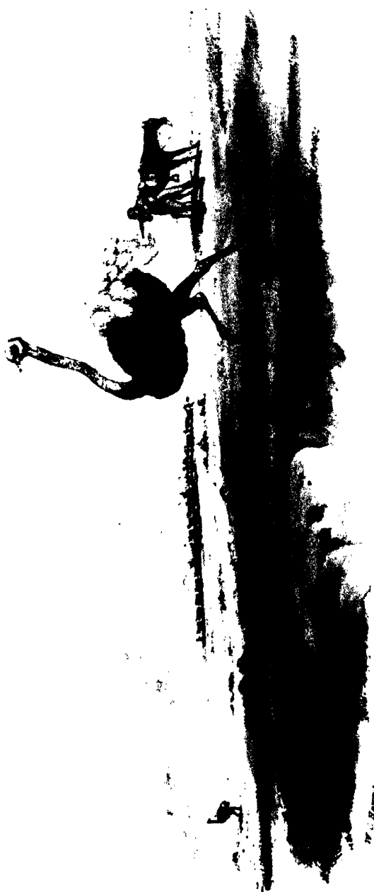
HUNTING THE OSTRICH