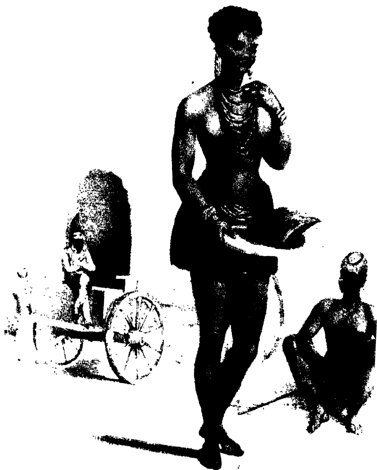
FRUEY, THE GUPIQUA MAN