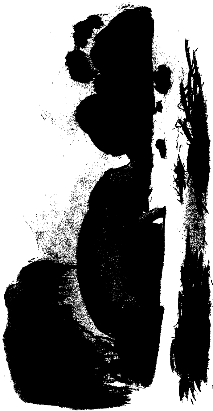
SHOOTING THE HIPPOPOTAMUS