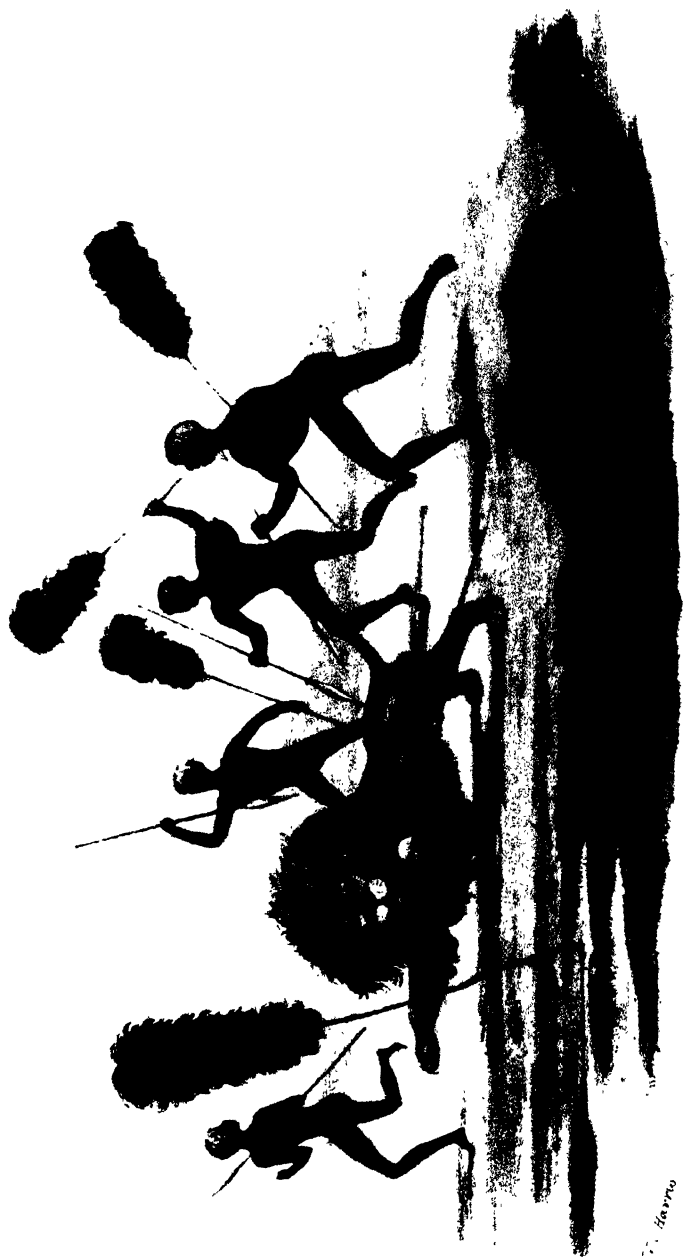
PECHUANA HUNTING THE LEP