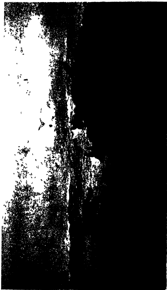
Wild Doas chasing Zebra