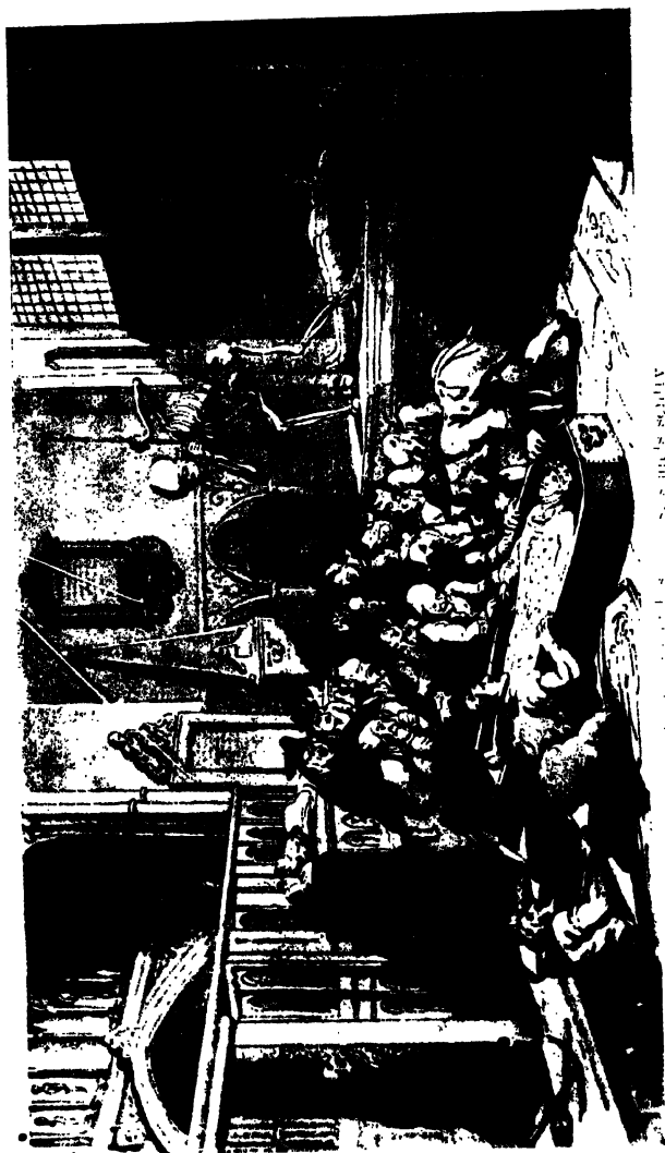
At the St. Michael's