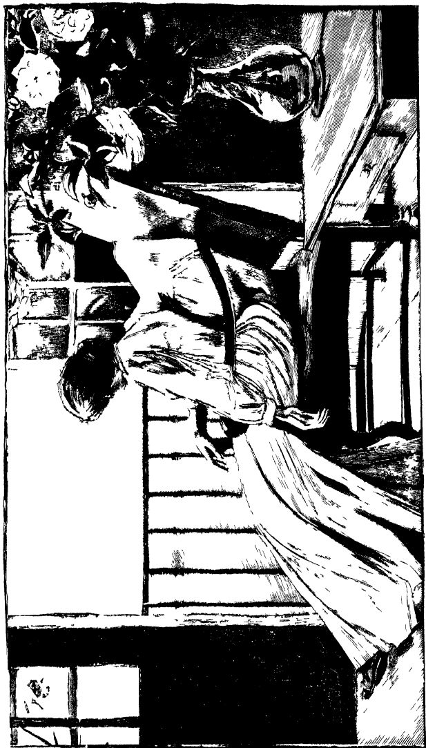
Angelique remained near to it.