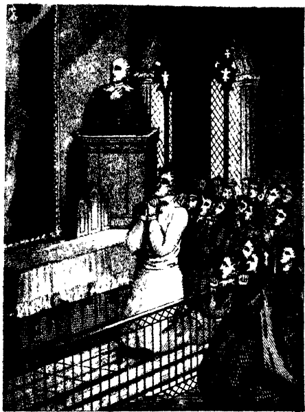
The Church was nearly full of people, every one present with apparently intense devotion to the passing hour. The Altar Page 115