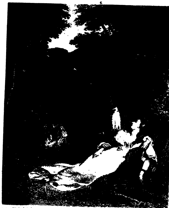
A \vdash A