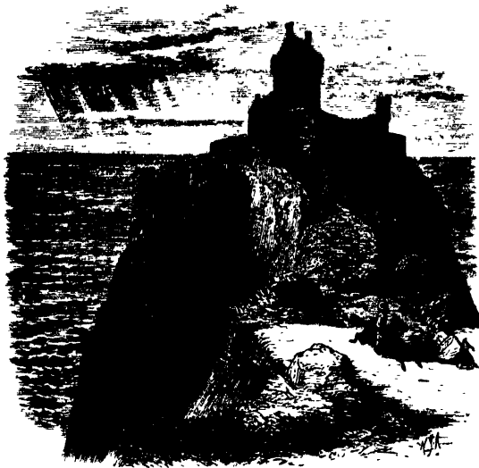
WOLF'S CRAG FAST CASTLE.