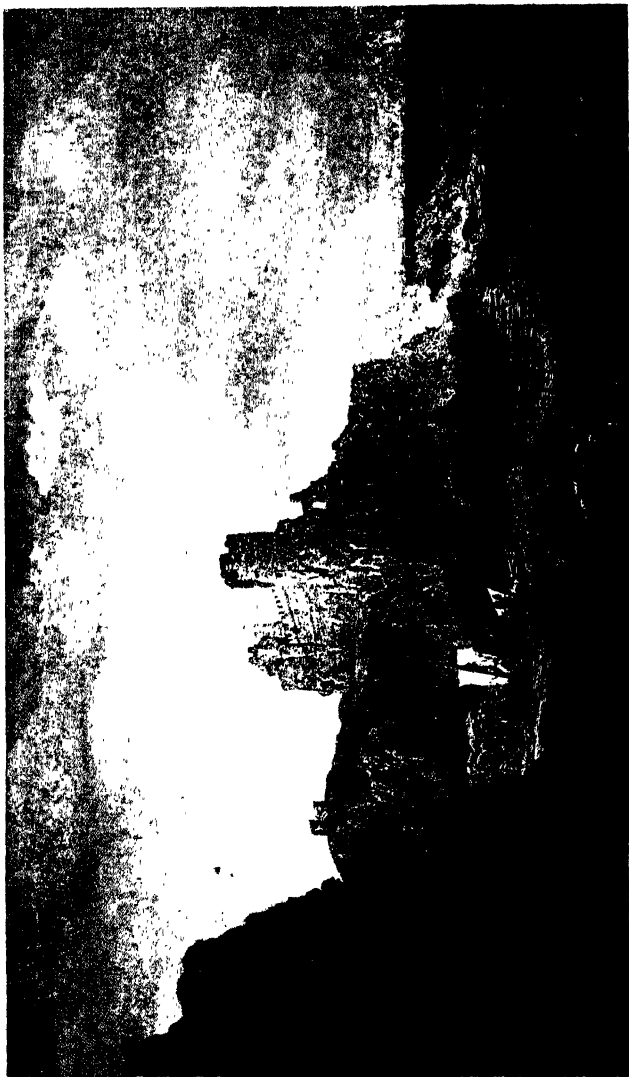
A. N. S. 1914.