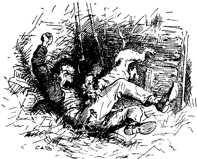
"KOSCIUSKO AND I FROLICKED AROUND."