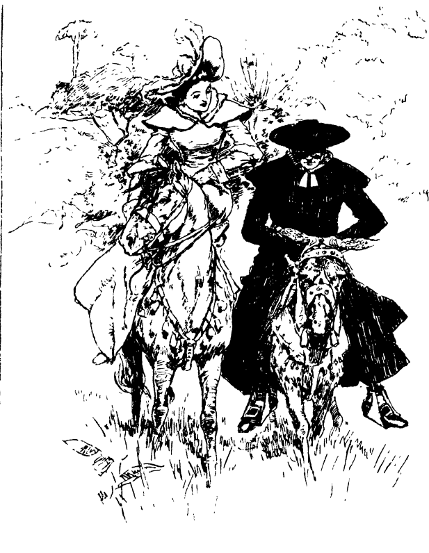
PEPITA AND THE YOUNG PRIEST.

London: Walter Scott, Ltd., Paternoster Square.