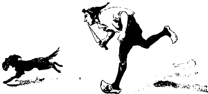
'KAPBLOK, THE BUTCHER'S MAN.'

"Those who wish to compare the humour of several countries must needs have in their possession such a rich storehouse as this is of the Humour of Holland."— Irish Times .