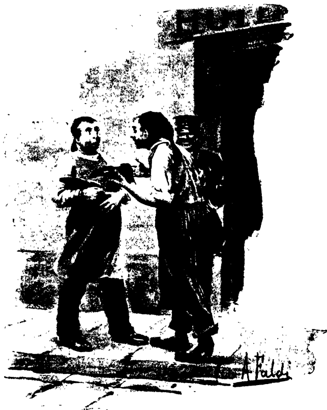
WHEN GREEK MEETS GREEK.