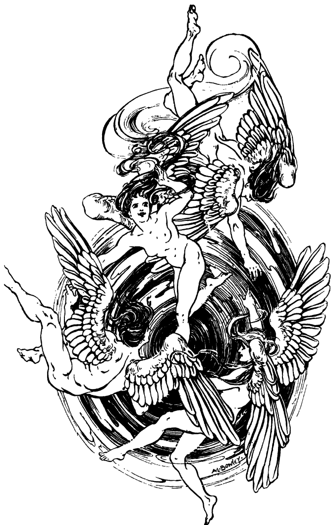
The winds came from all quarters and danced La Tempête with the clouds.