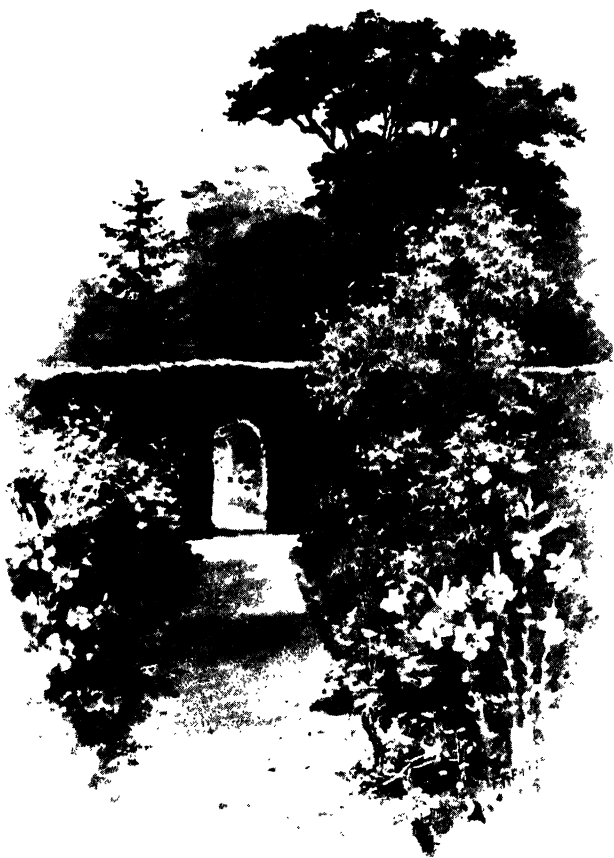
AN OLD ORANGERY.