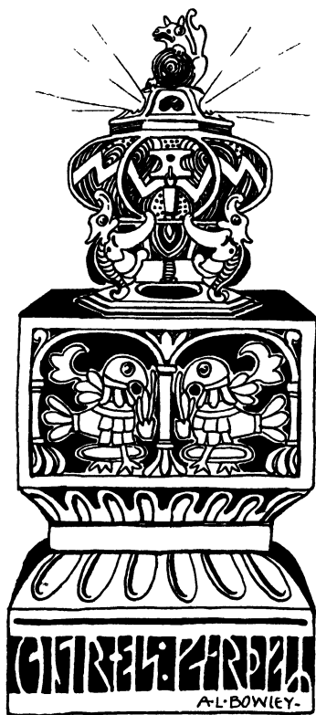
On the altar was a casket.

"Faster," said To-morrow; "there must be no delay," and she beckoned him on. His breath came in gasps, and his knees shook under him—he couldn't have