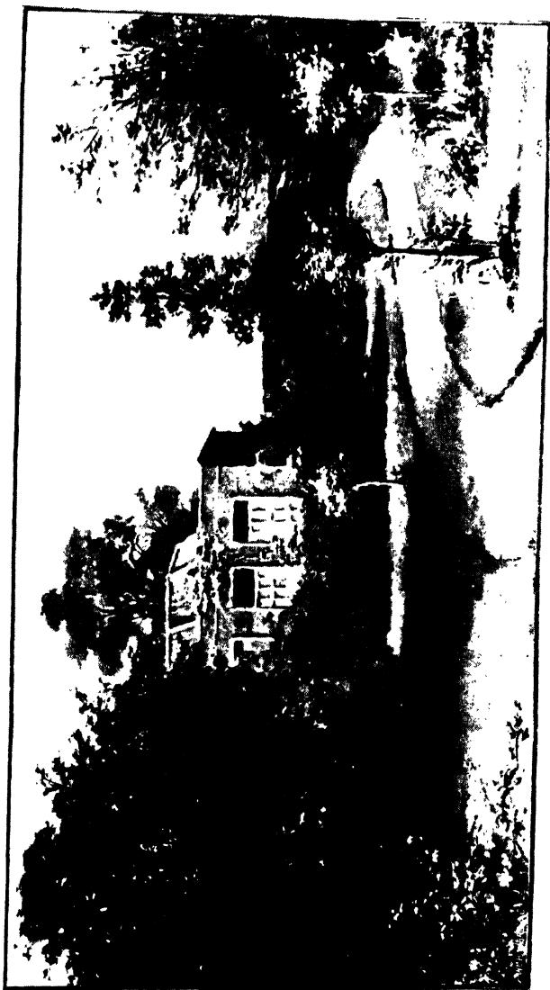
THE WALLED GARDEN.