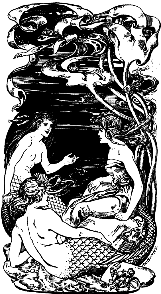
Sometimes with the Mermaids.