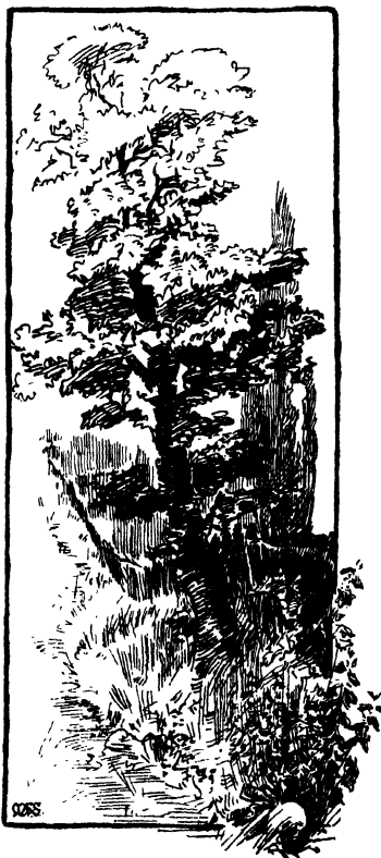
The Turnip lay in the long grass by the roadside.

The Turnip lay in the long grass by the roadside ; it had been raining, and the road