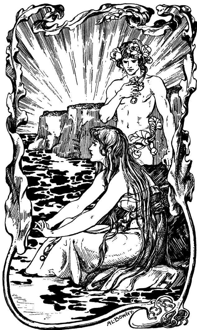
He found her as usual sitting on a rock watching for the Torpedo-boat.