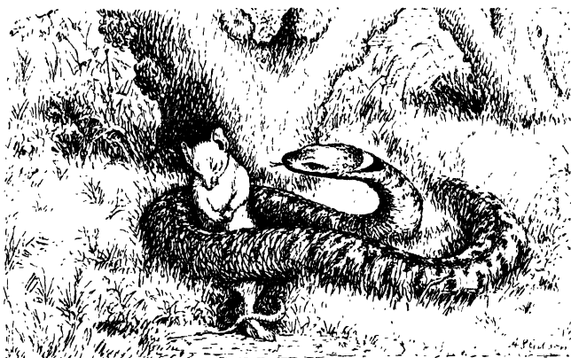
Brunette, after hearing the news, married the snake.

Brunette, after hearing the news, married the snake, and was devoured at the wedding-