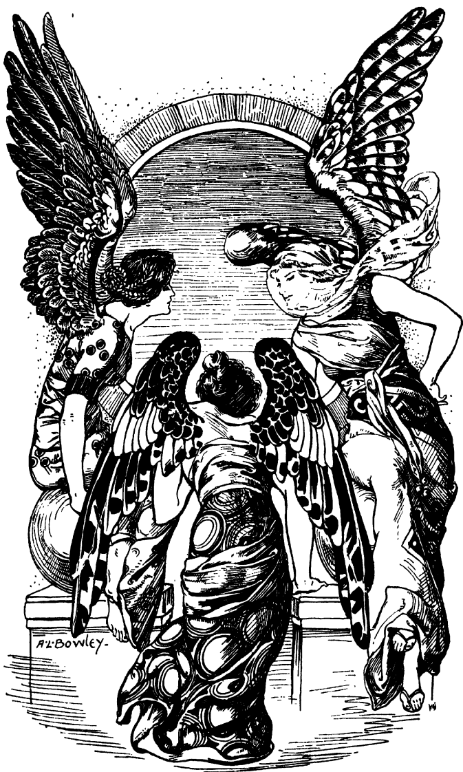
Watching for the first sunbeam.