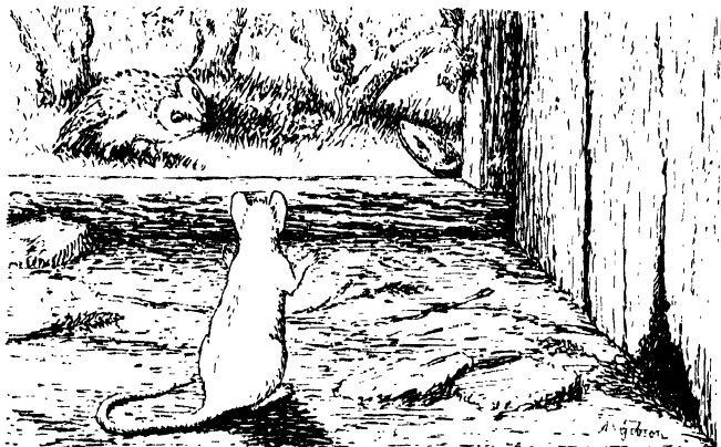
An owl and a snake both wished to marry her.

Moustache himself one day, quite captivated by the entrancing manner in which Brunette had squeaked "Three blind mice," asked her to be his wife; and Brunette whispered, "Yes, if there was something