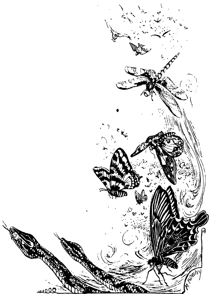
Going to the pageant of Iris.