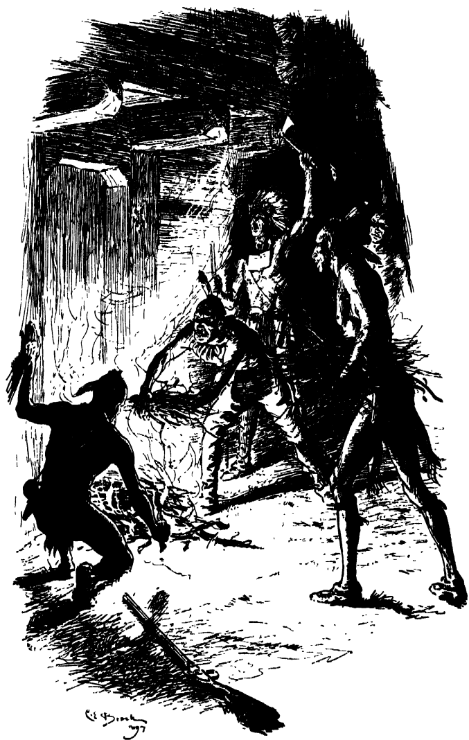
The Indians were making a pile of brush against the door.