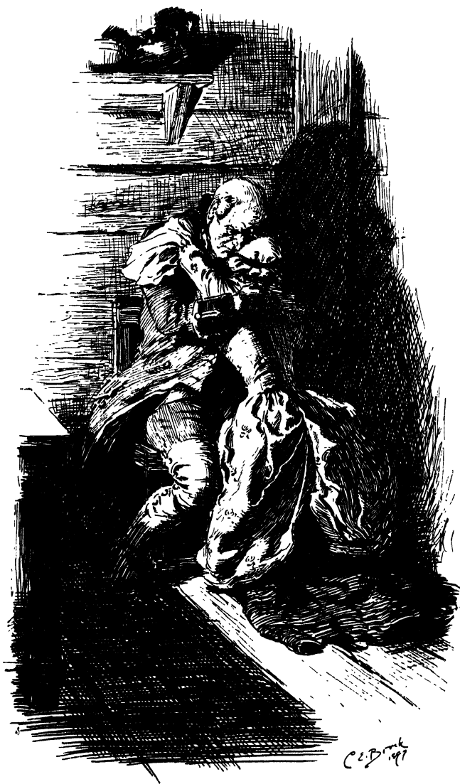
Mabel threw herself into her father's arms and sobbed on his bosom like an infant.