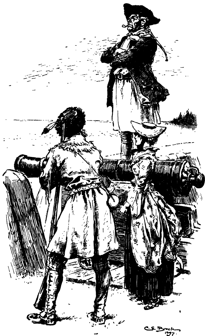
He made a deliberate survey of the expanse of water before him.