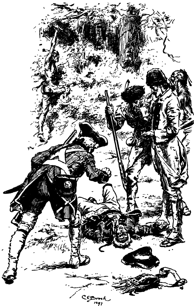
Arrowhead, uttering a yell, bounded into the bushes.