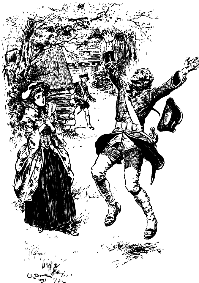
The Corporal gave a spring into the air.