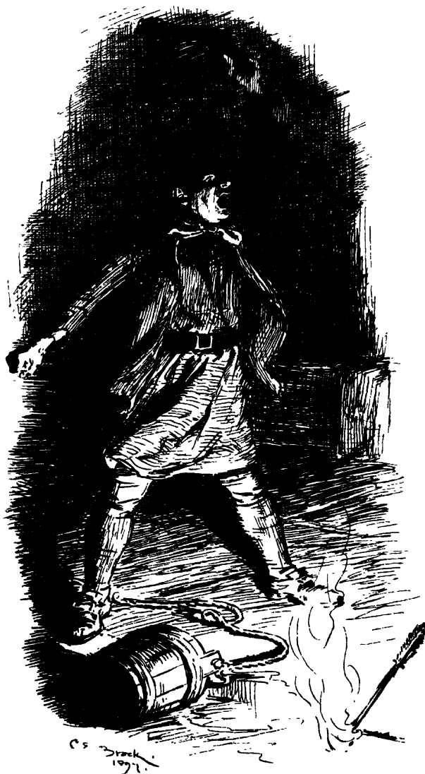
The old sailor waved his hat and gave three cheers.