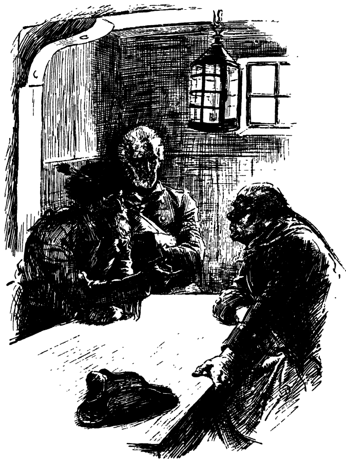
Pathfinder assumed the office of spokesman.