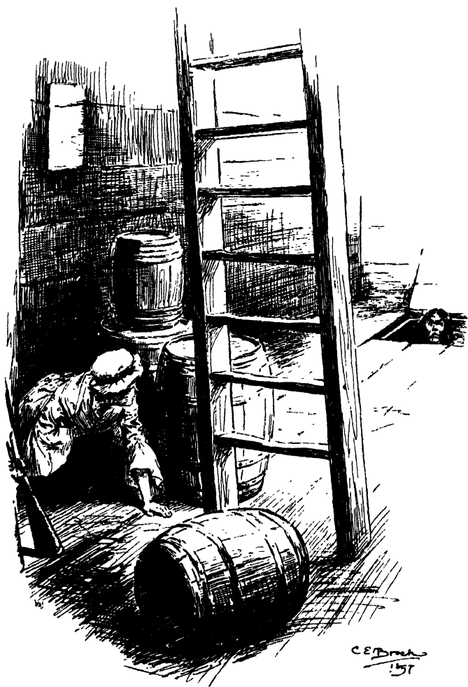
The savage countenance was revealed, as it might be, inch by inch.