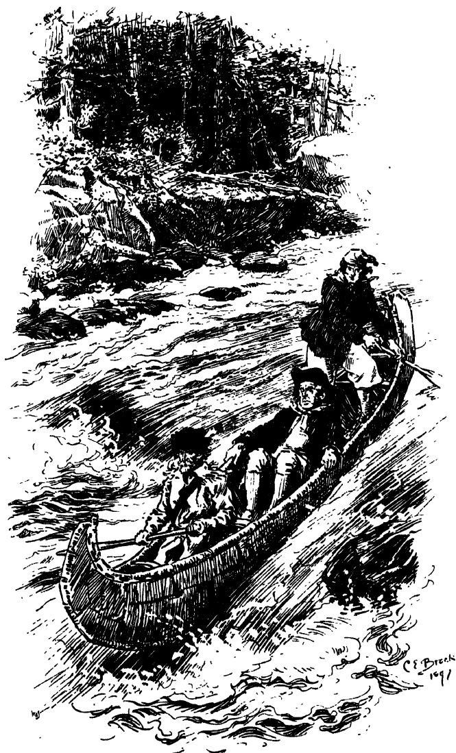
He felt the bow of the canoe tip.