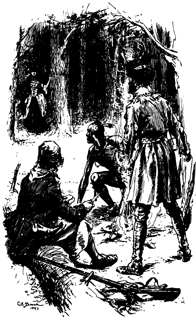
She trod upon a dried stick.