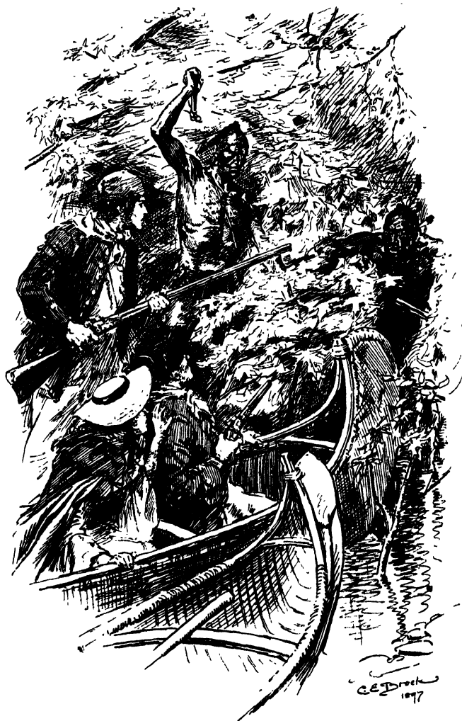
The tomahawk of the Delaware descended on the shaven head of his foe.