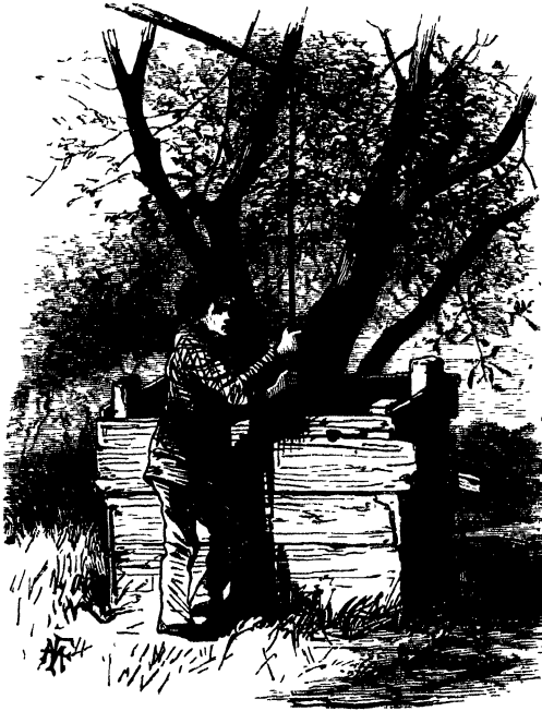
BEN AT THE WELL.

a brook dancing through the orchard, birds singing in the elm avenue, and all the world as fresh and lovely as early summer could make it.