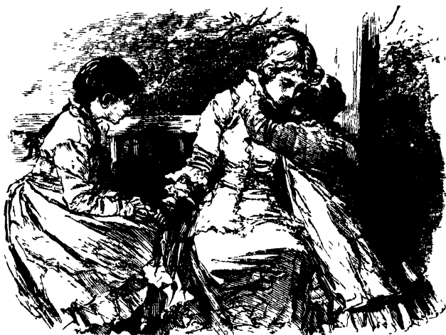
MISS CELIA AND HER LITTLE FRIENDS.

"Ma said you wouldn't want our duds round, so we took them all home," answered Betty, with a wistful face.