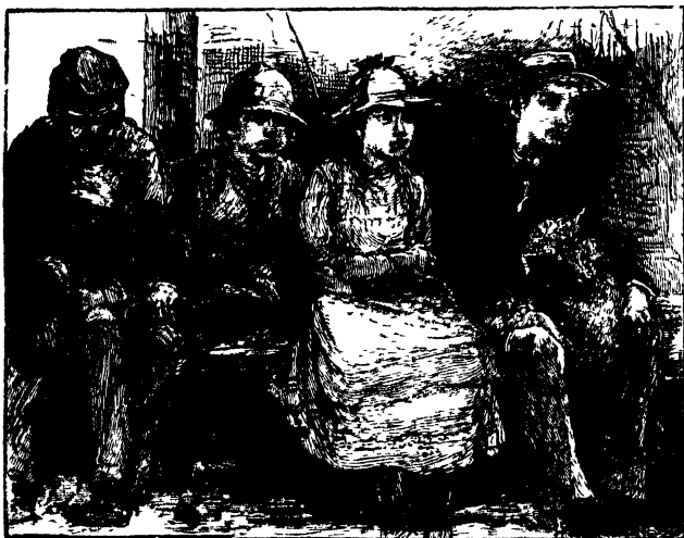
"SETTLED IN GOOD PLACES TO SEE AND HEAR."