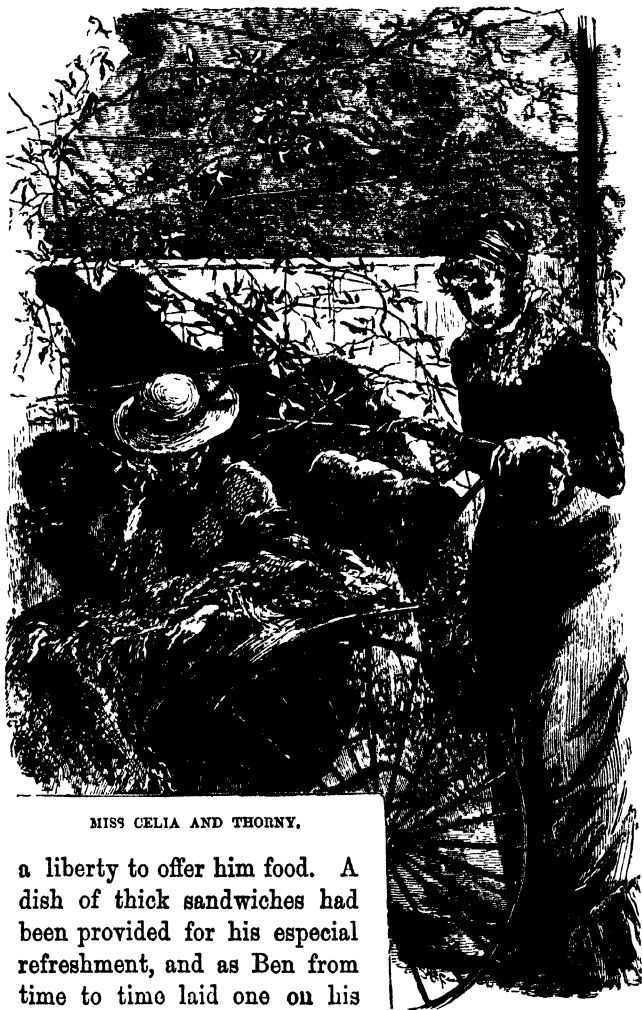
MISS CELIA AND THORNY.

a liberty to offer him food. A dish of thick sandwiches had been provided for his especial refreshment, and as Ben from time to time laid one on his