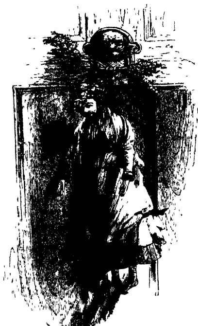
"A RAG BABY HUNG FROM THE RUSTY KNOCKER"

calico, richly trimmed with red flannel scallops, shrouded her slender form, a garland of small flowers crowned her glossy curls, and a pair of