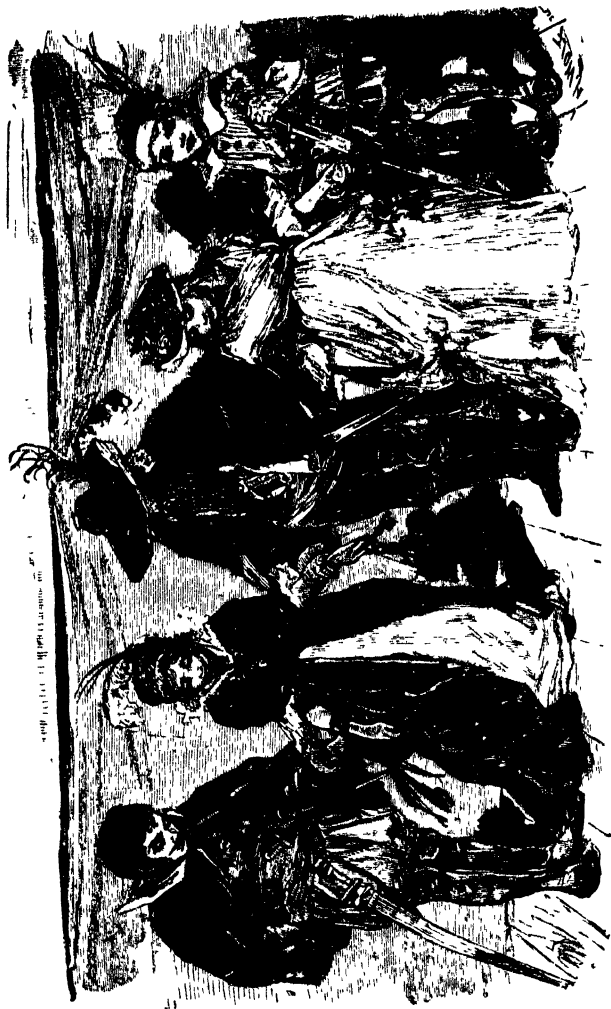
BUT-BEARD.—THE PERFORMERS BOWING THEIR THANKS.