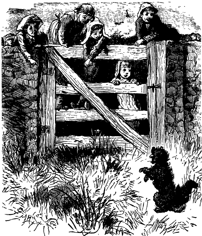
SANCHO RECOGNIZES BETTY.

cried Betty, bewildered by the familiar ways of this unfamiliar-looking dog.