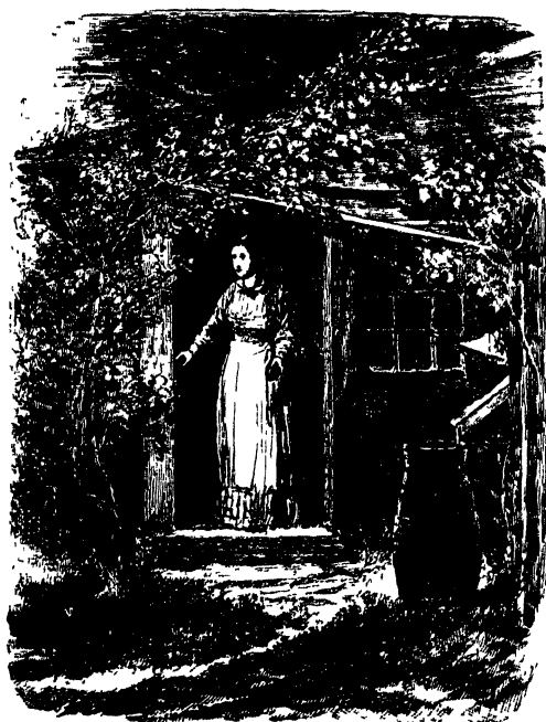
MRS. MOSS WELCOMING BEN'S FATHER.

"Now don't say a word about it, but sit down and rest, and we'll have tea in less'n no time. Ben must be tired and hungry, though he's so happy I don't