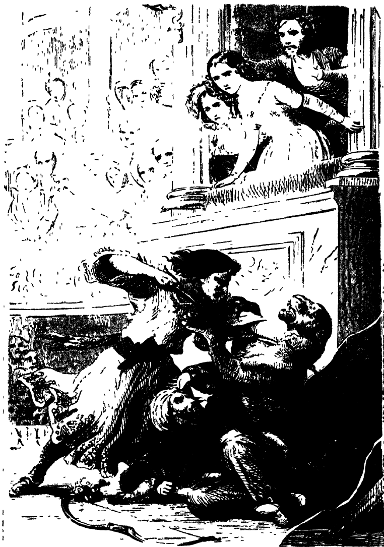
IVALMA RESCUING MOROK FROM THE PANTHER.