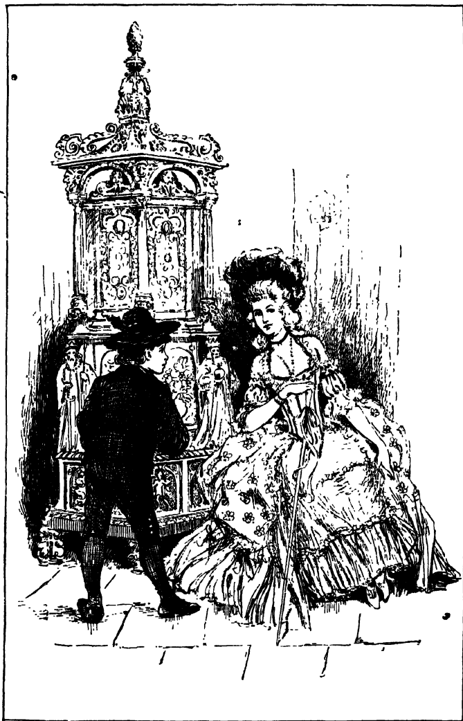
In the old house-room there is a large white porcelain stove.