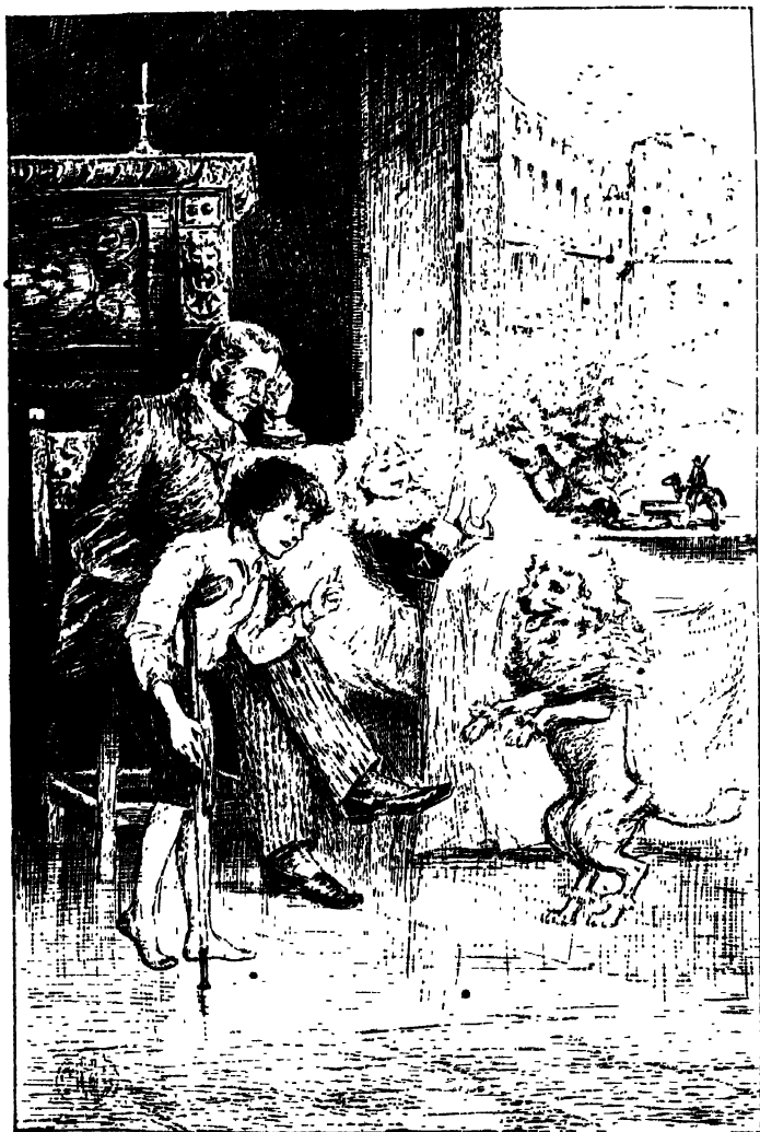
Moufflou acquitted himself ably as ever