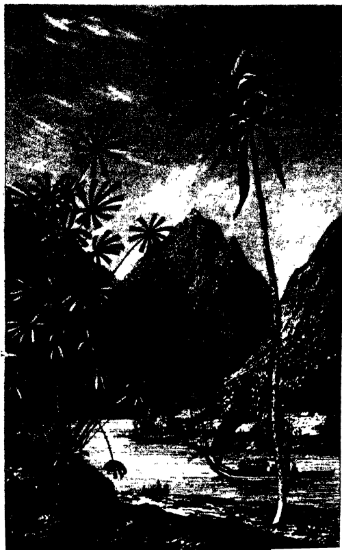
Descent of the Lighthouse