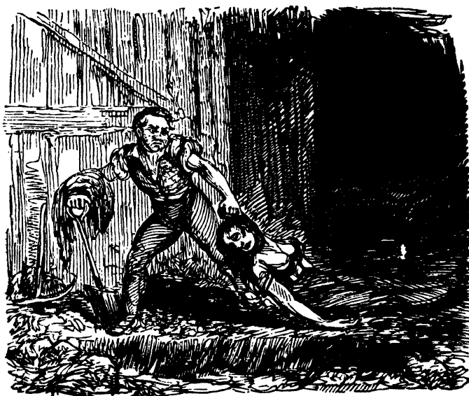
Reproduction of wood engravings by George Cruikshank, which appeared in the Spectator of August 16th, 1828, illustrating an article on the murder of Maria Marten