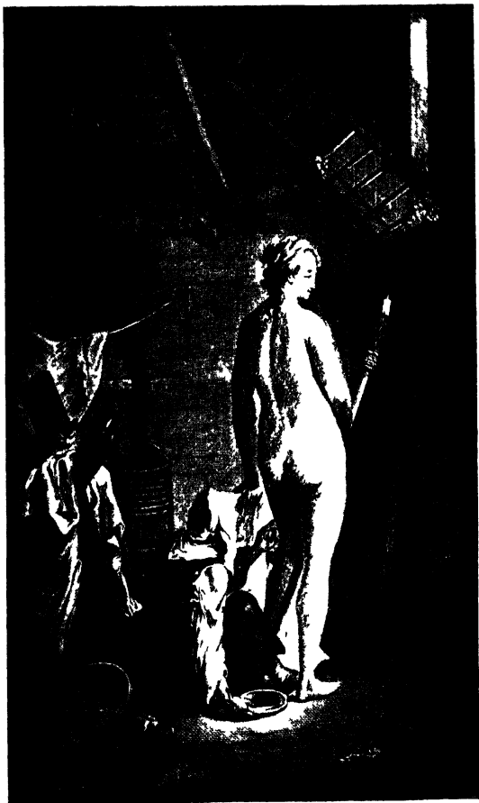
OFF TO THE SABBAT Queverdo