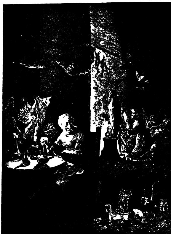
THE DEPARTURE FOR THE SABBAT David Teniers