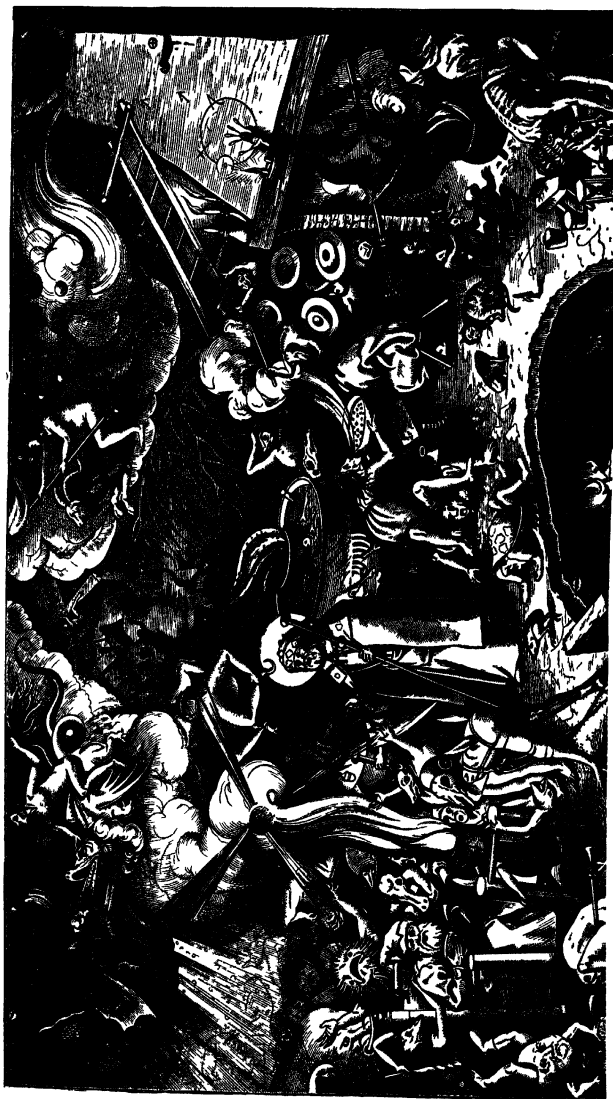
S JAMES VISITS THE WARLOCK'S DEN Breughel