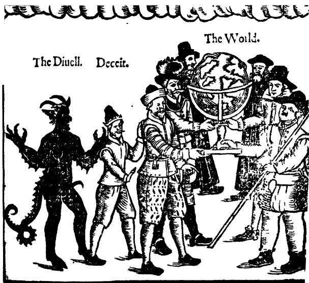
THE WORLD TOST AT TENNIS The First Quarto

Inuented and set downe, By { Tho: Middleton } Gent. / & { William Rowley }