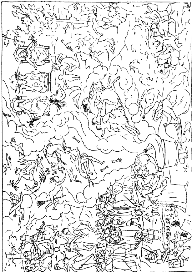
THE SABBAT Ziarnko