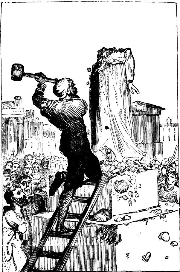
DEFACING THE IMAGE OF SHADDAL.—P. 31