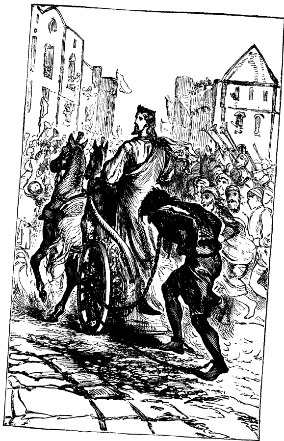
DIABOLUS BOUND IN CHAINS.—p. 126