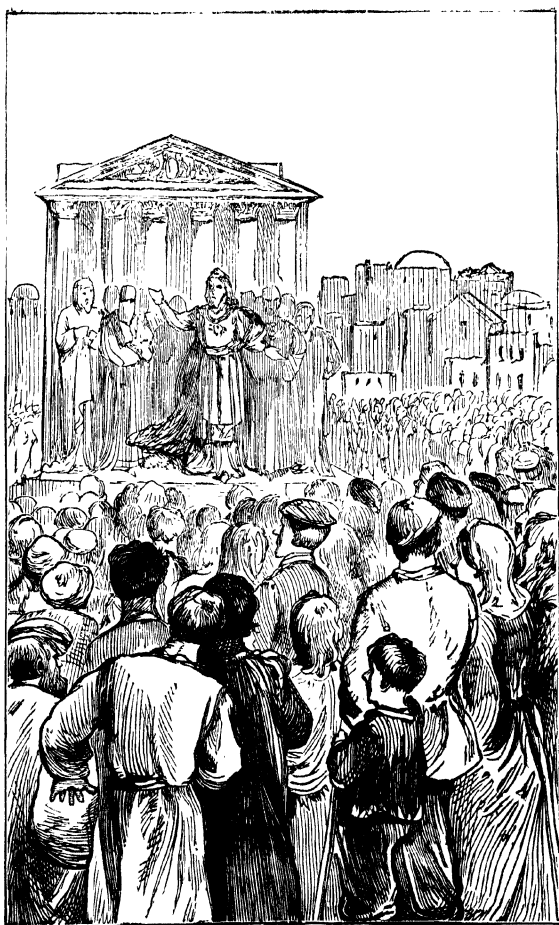
THE PRINCE'S SPEECH TO MANSOUL.—P. 196