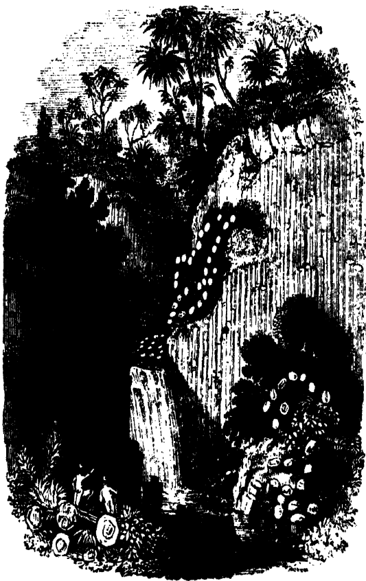
BASALTIC ROCKS AND CASCADE OF REGLA.