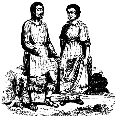
Costumes of the Indians of Mechoacan.

ground as resulting from the flow of lava over the original surface of the plain.