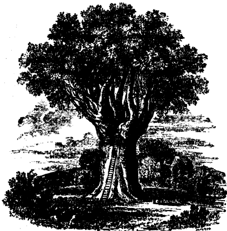
Dragon-tree of Orotava.