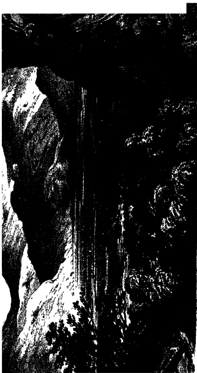
VIEW NEAR VODENA, - MOUNT OLYMPUS IN THE DISTANCE