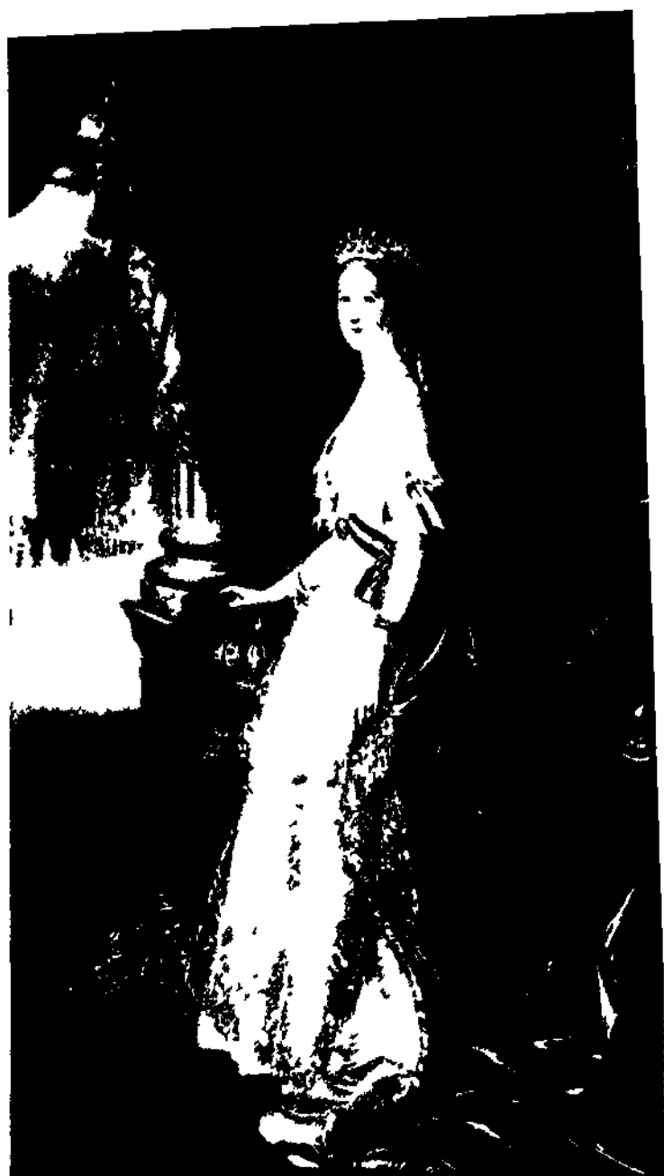
THE EMPRESS EUGÉNIE IN ROYAL ROBES