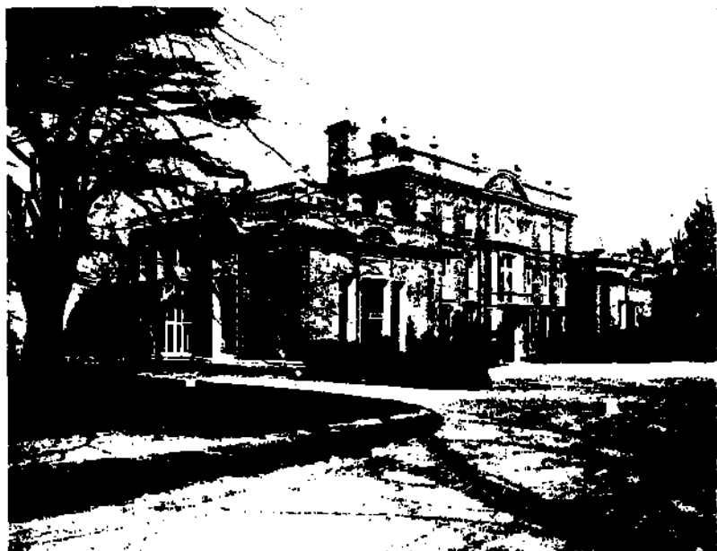
CAMDEN HOUSE, CHISLEHURST

First Residence in England of Napoleon III and the Empress Eugénie