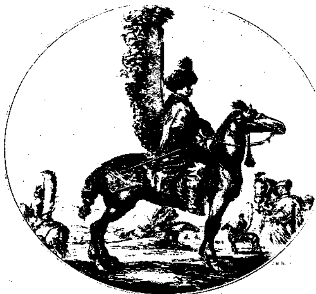
A POLISH HUSSAR OF THE SEVENTEENTH CENTURY