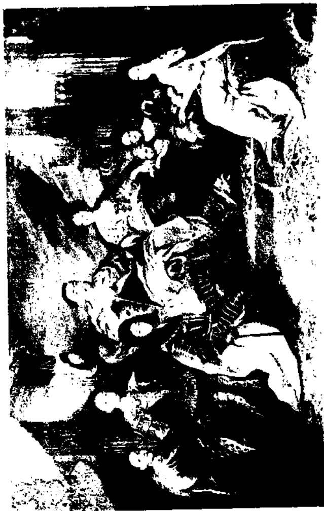
JOHN SOBIESKI, SURROUNDED BY HIS FAMILY (In the Wilanow Collection. Artist unknown)