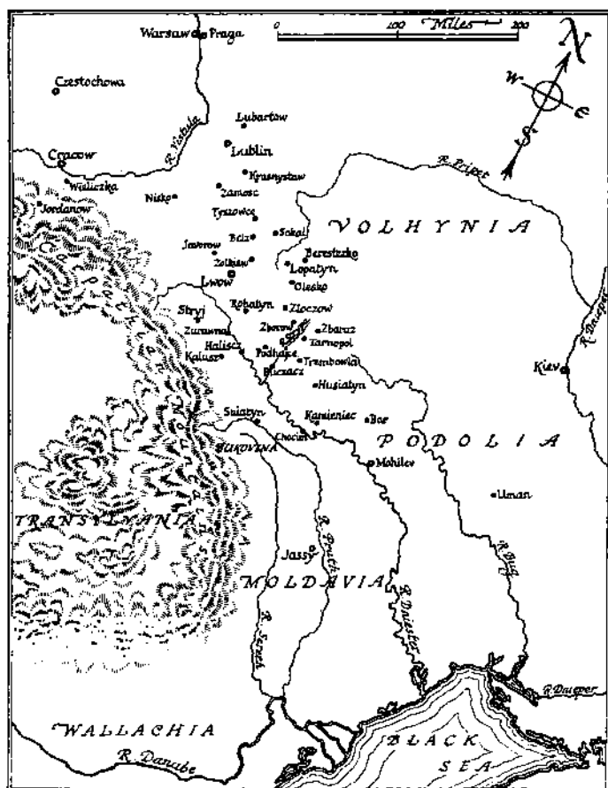
THE EASTERN BORDER-LANDS OF POLAND IN THE TIME OF SOBIESKI