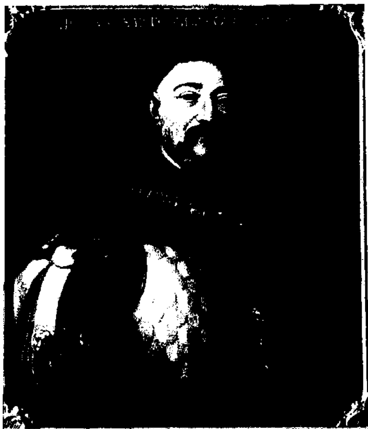
JOHN III, KING OF POLAND

(A contemporary portrait in the National Museum at Warsaw. Artist unknown)