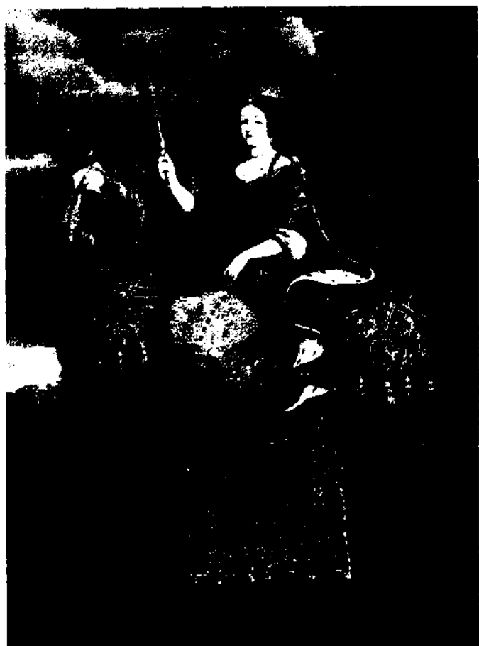
QUEEN MARIE CASIMIRE IN HER CORONATION ROBES

(Jerzy Siemiginowski. Wilanow Collection)