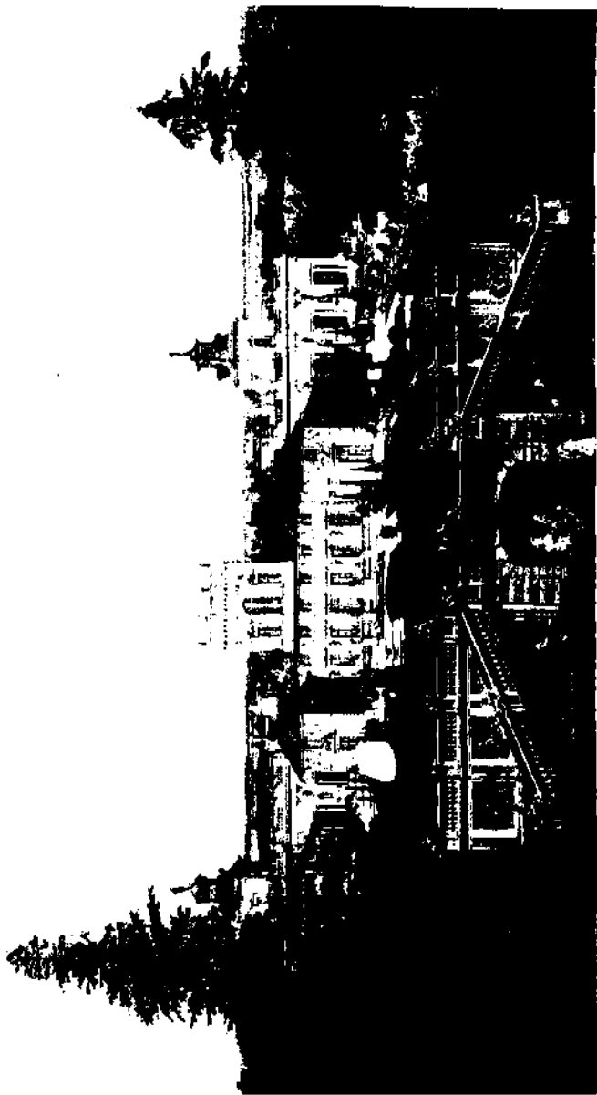
THE PALACE AT WILANOW From a painting by Gaudette at Warsaw.